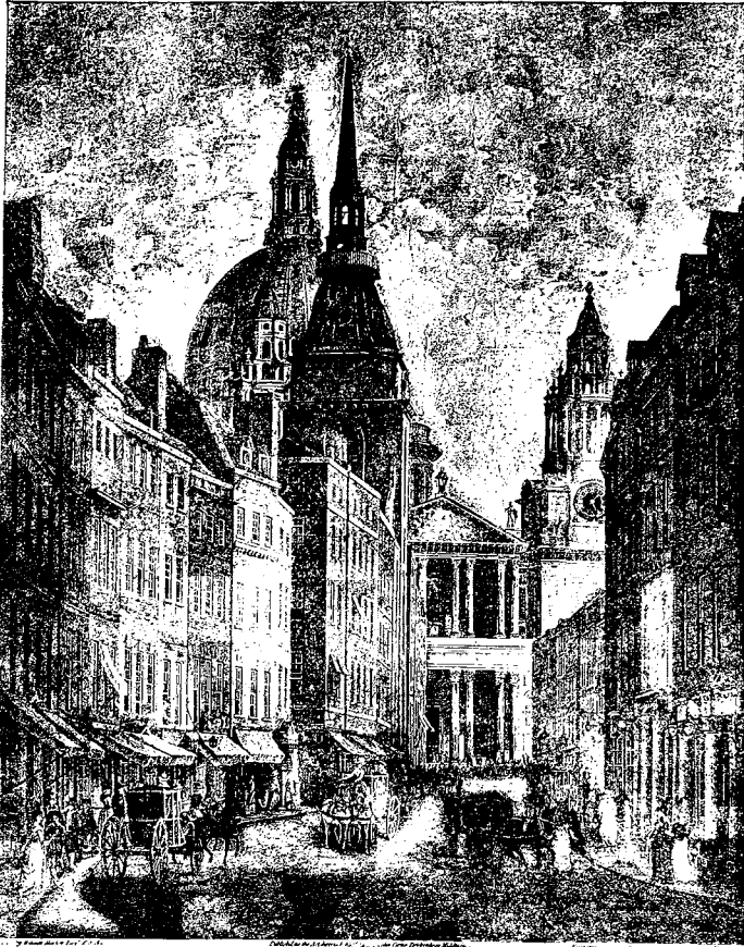
LUDGATE HILL IN THE LAST CENTURY.