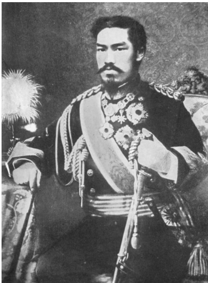
The Emperor Mutsu Hito