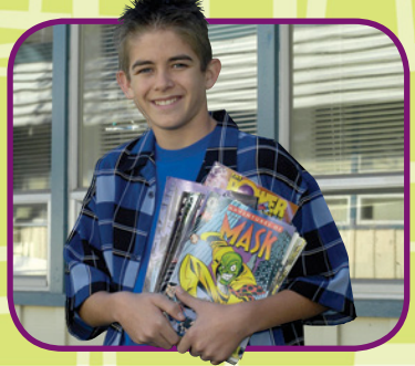
My name is Tommy. I'm from Australia. I like music and comic books. I'm 11.