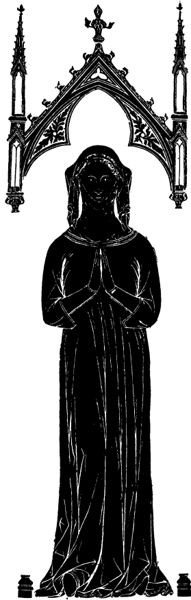
Fig. 4. Lady Joan de Cobham, c. 1320, Cobham, Kent

Lady de Northwode has a mantle with side openings, through which the arms pass. It is turned back in front to show the lining of variegated fur. The head