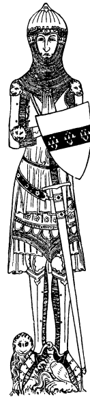
Fig. 2. Sir John de Creke, c. 1325, Westley Waterless, Cambs.

It therefore shows beneath, first the gambeson, then the hawberk of mail, and, finally, the padded haqueton. The hands are bare and the hawberk sleeves short, thus showing the forearms entirely protected by vambraces of plate worn under, not over, the mail. The upper arms have pieces of