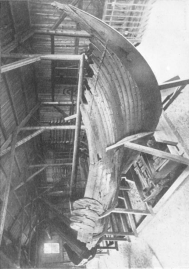
The Gokstad ship