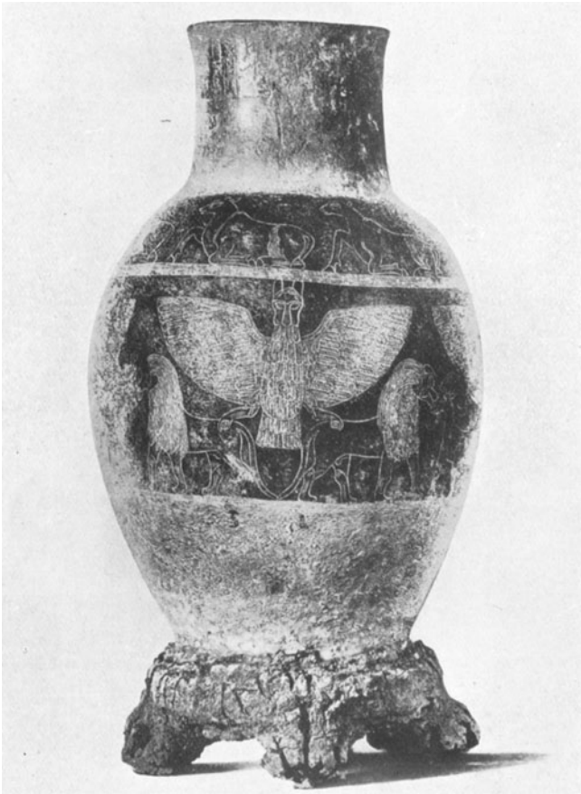
Silver Vase of Entemena