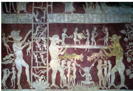
Figure 1.1: The Doom Painting at St Peter and St Paul's Church in Chaldon, Surrey is from the twelfth century and clearly shows the damned at the bottom.