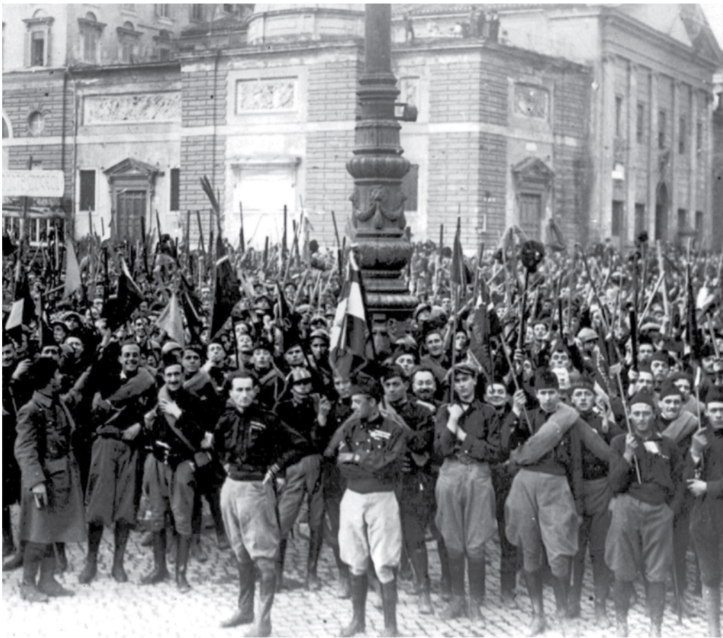
Figure 2.1 Fascists in Rome, November 1922, after their triumphant ‘March’ on the city

What can you learn from this photograph about the nature of the Italian Fascist Party in 1922?