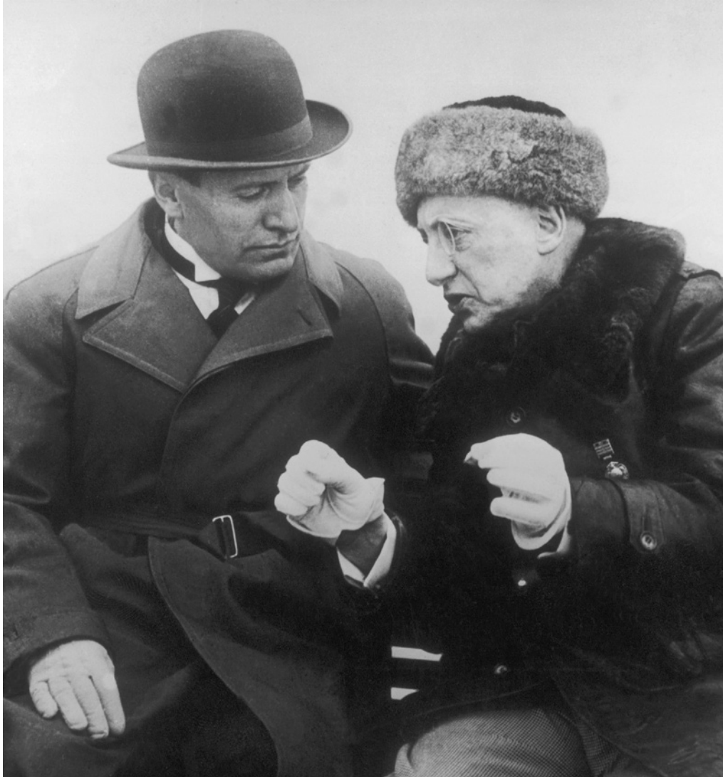
Figure 2.5 Benito Mussolini and Gabriele D'Annunzio in 1925