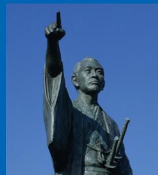
Figure 2.3 Yoshida Shoin (1830–59)

From the end of the 17th century, education in Japan was increasingly based on strong nationalistic and pro-imperial principles. In part, this new National Learning involved a rejection of the philosophical and political ideas of Chinese Confucianism, and a turn to Japan's own Shinto religion and philosophy. The influence of such thinkers as Motoori Norinaga extended well into the 20th century. It stressed how Japan had been created by the Sun Goddess – and how Japan's imperial families were descended from the Sun Goddess, and that the emperor was the 'living god'. This belief became an official state belief after the Meiji Restoration in 1868; was an essential part of the pro-emperor nationalism which was pushed by the political new system; and was taught to all Japanese students until the end of the Second World War.