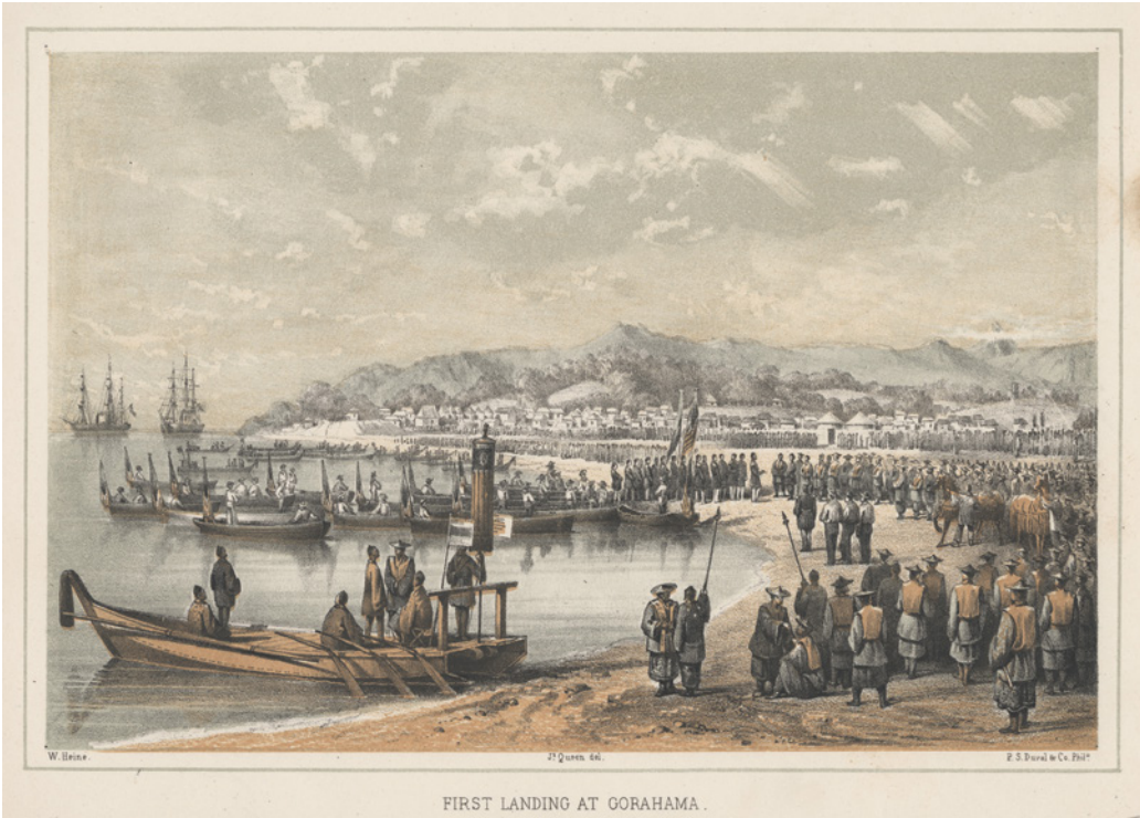
Figure 2.2 The landing of Commodore Perry and his ‘black ships’ at Yokohama, 8 March 1854

Fact : Following the Treaty of Amity and Commerce, similar treaties were soon signed with Britain, France and Russia. These soon became known as the ‘unequal treaties’ – in particular, as they granted extra-territorial rights to the citizens of the countries signing the treaties. Such western-imposed treaties were not just limited to Japan, but were also made with other Asian countries – and with China in particular. These led to much nationalist resentment in Japan and in other affected countries.