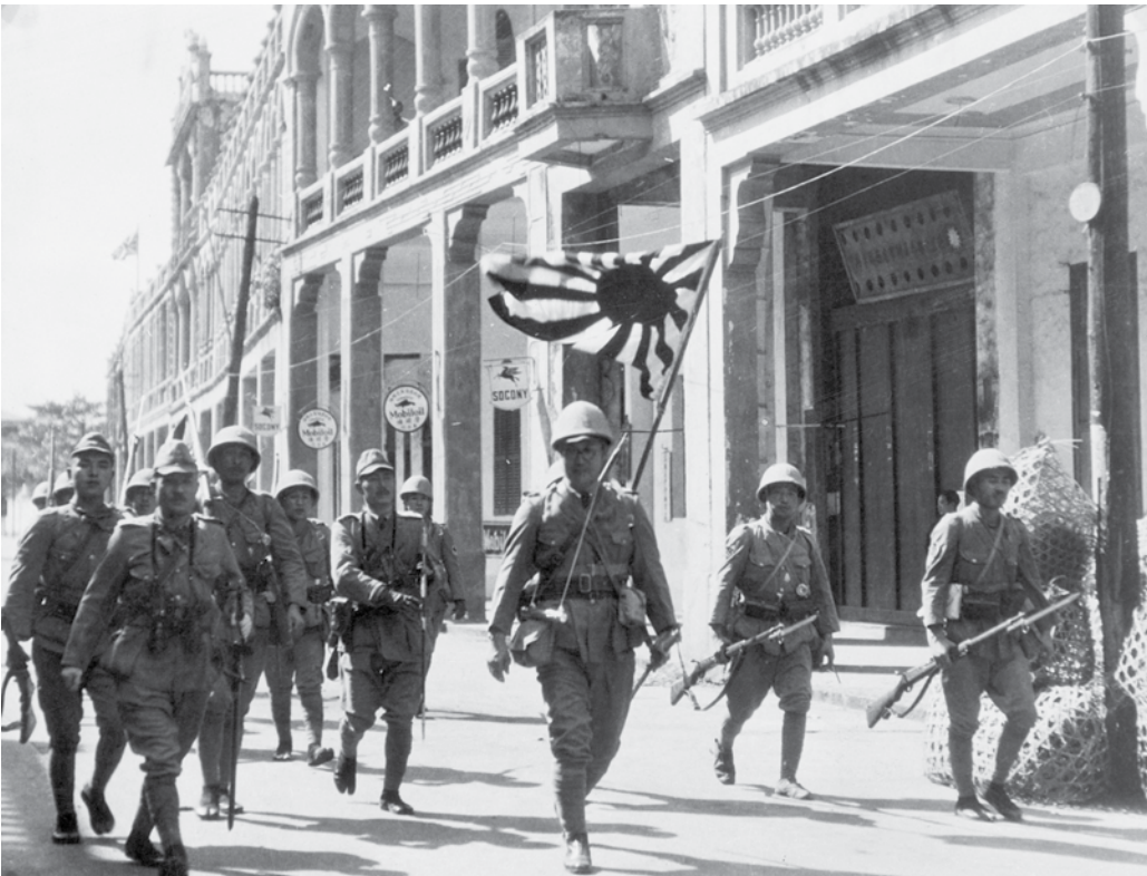
Figure 2.4 Photo of Japanese troops with the rising sun flag

QUESTION Why was the rising sun an important symbol in Imperial Japan?