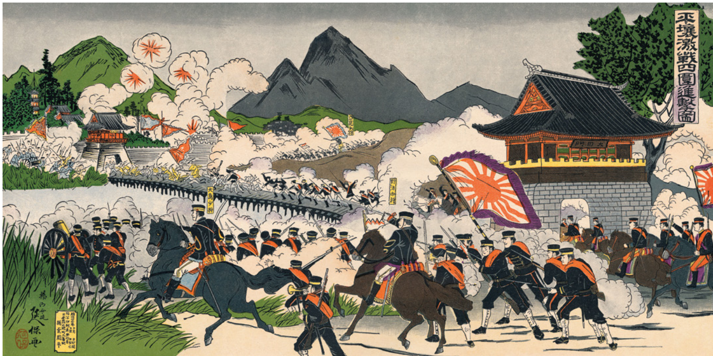
Figure 2.5 A Japanese print of the Battle of Pyongyang, Korea, 1894. Following the Japanese victory here, Japanese armies then invaded Manchuria

As early as 1876, Japan had forced Korea to establish diplomatic relations – and to agree to an ‘unequal treaty’ which gave special rights to Japanese people in Korea. When this led to nationalist protests in Korea, both China and Japan took advantage of the turmoil to send troops into the country. Immediate hostilities between China and Japan were avoided by the Li-Ito Convention of 1885, which was an agreement that both countries could station troops in Korea. But unrest continued and, in August 1894, tensions between China and Japan over rivalry in Korea led to the First Sino–Japanese War. The Japanese army and navy – both of which had been modernised since 1868 – inflicted defeats over the less-advanced Chinese forces. This compelled China to seek peace in 1895. The Treaty of Shimonoseki of April 1895 resulted in Chinese recognition of Korean independence, and saw Japan obtaining various territories, including Formosa (now known as Taiwan). China also had to sign a commercial treaty with Japan, as well as granting some manufacturing rights to Japanese firms.