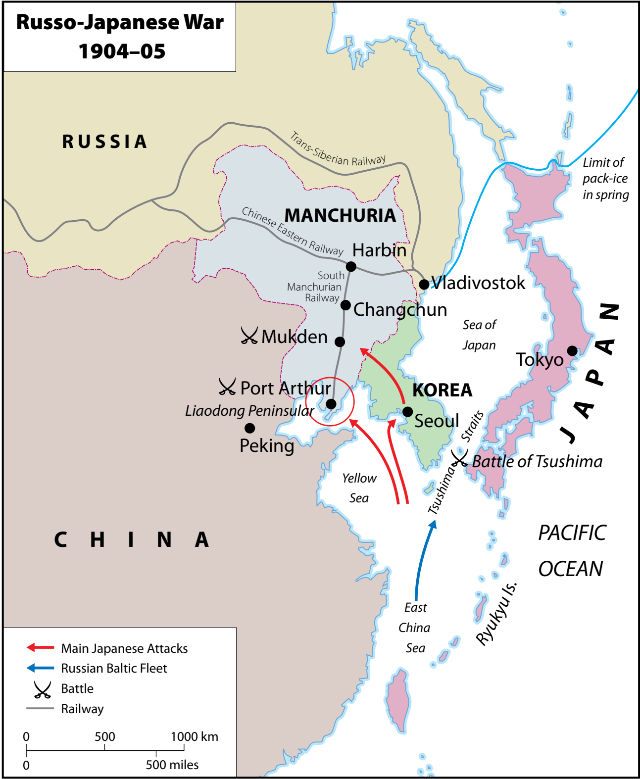
Figure 2.6 Russo–Japanese War, 1904–05