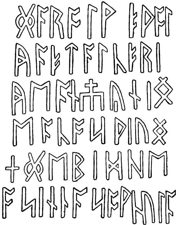
c. Bewcastle Runes

The Bewcastle shaft* has the Baptist, the Lord in Benediction, a man with a bird, panels with interlacements, foliage scrolls, grape scrolls, a sun- dial, a long panel of chequers, and one whole side occupied by a vine scroll with birds and animals as at Ruthwell. There is one long inscription in runes, above the man with the bird and presumably referring to him;