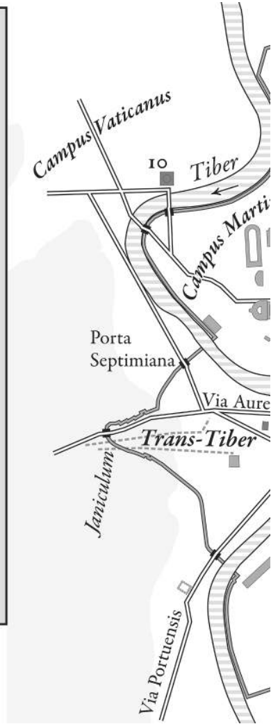
Map 2 Rome in 275.

the city. This also facilitated crowd control. Finally, Aurelian added free pork for those on the dole and sold wine at subsidized prices to the population at large. 20