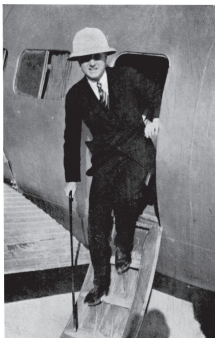
SIR SAMUEL HOARE