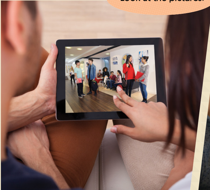
Look at the pictures.