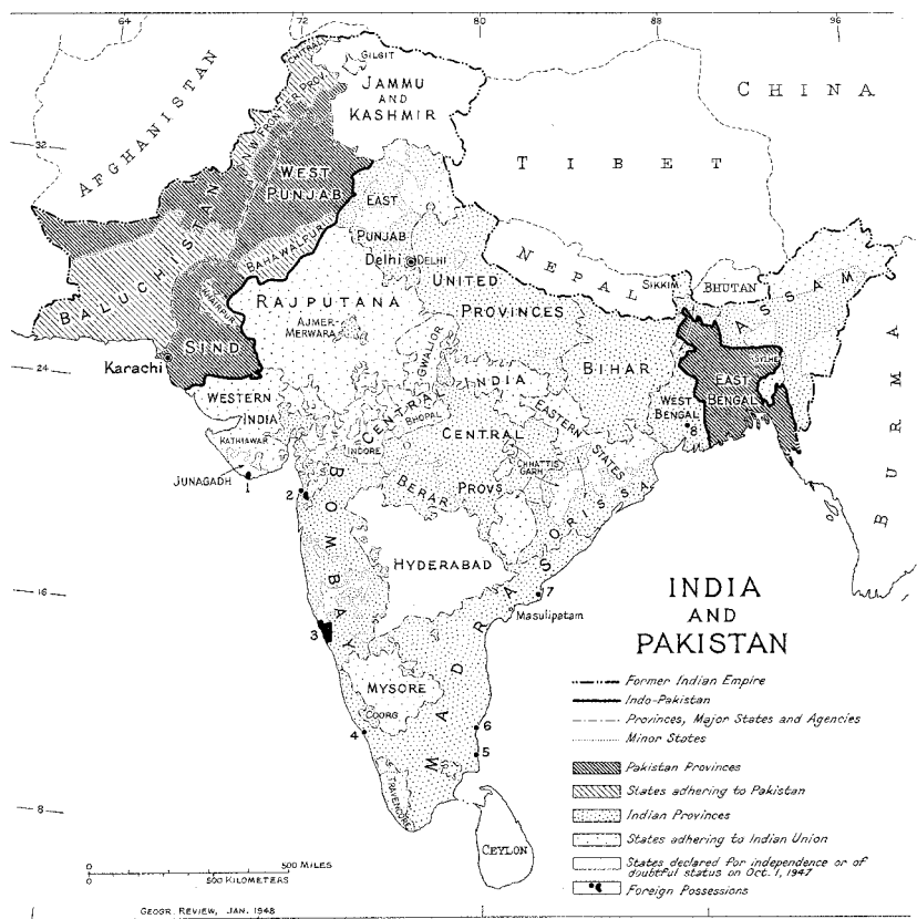
Territorial structure of India and Pakistan. Boundaries: 1, Former Indian Empire; 2, Indo-Pakistan; 3, Provinces, Major States and Agencies; 4, Minor State; 5, Pakistan Provinces; 6, States adhering to Pakistan; 7, Indian Provinces; 8, States adhering to Indian Union; 9, States declared for independence or of doubtful status on October 1, 1947; 10, Foreign Possessions: 1, Diu, 2, Damão, 3, Goa (Portuguese); 4, Mahé, 5, Karikal, 6, Pondichéri, 7, Yanam, 8, Chandernagor (French).