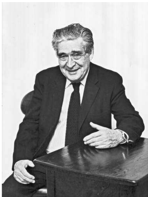
FIG. 2 Photograph of Sir Moses Finley.