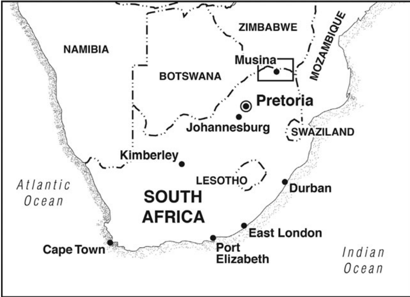
Map 1. The Zimbabwean-South African border in the region.

Cambridge University Press 978-1-107-11122-6 - Zimbabwe's Migrants and South Africa's Border Farms: The Roots of Impermanence Maxim Bolt Frontmatter More information