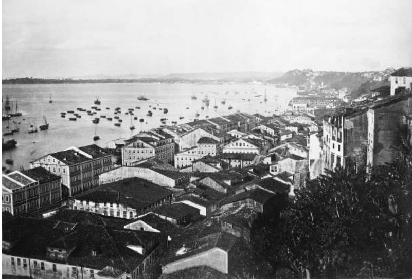
Figure 1. View of the city of Salvador, Bahia.

obtain their manumission, sometimes free of charge, but more often – especially for African-born slaves – by purchasing their freedom. These freedpersons, most of whom worked in the streets, played a key role in the formation of Candomblé, a religion whose broad outlines developed precisely when Domingos lived in Bahia. Many of the leading figures in nineteenth-century Candomblé appear in this book, and their life stories are intertwined with his. Called feiticeiros (witches or sorcerers) in the official records and the press, these diviners, healers, and heads of houses of worship were the target of systematic persecution by the Bahian police, but the authorities did not always agree on the best way to punish them, or even if they should be punished at all. The police agenda often stressed the danger that these people represented to law and order in a slave society because of their transactions with slaves who went to them for help in confronting their masters. But the fact that other free segments of the community were also Candomblé practitioners, including whites of some social standing, was not the least of the concerns of those who combated the beliefs and ritual practices that Africans brought to Brazil and transformed and re-created there. Sodré's life unfolds as part of this cultural conflict and serves as a narrative thread when telling the history of Candomblé in the Bahia of his time.