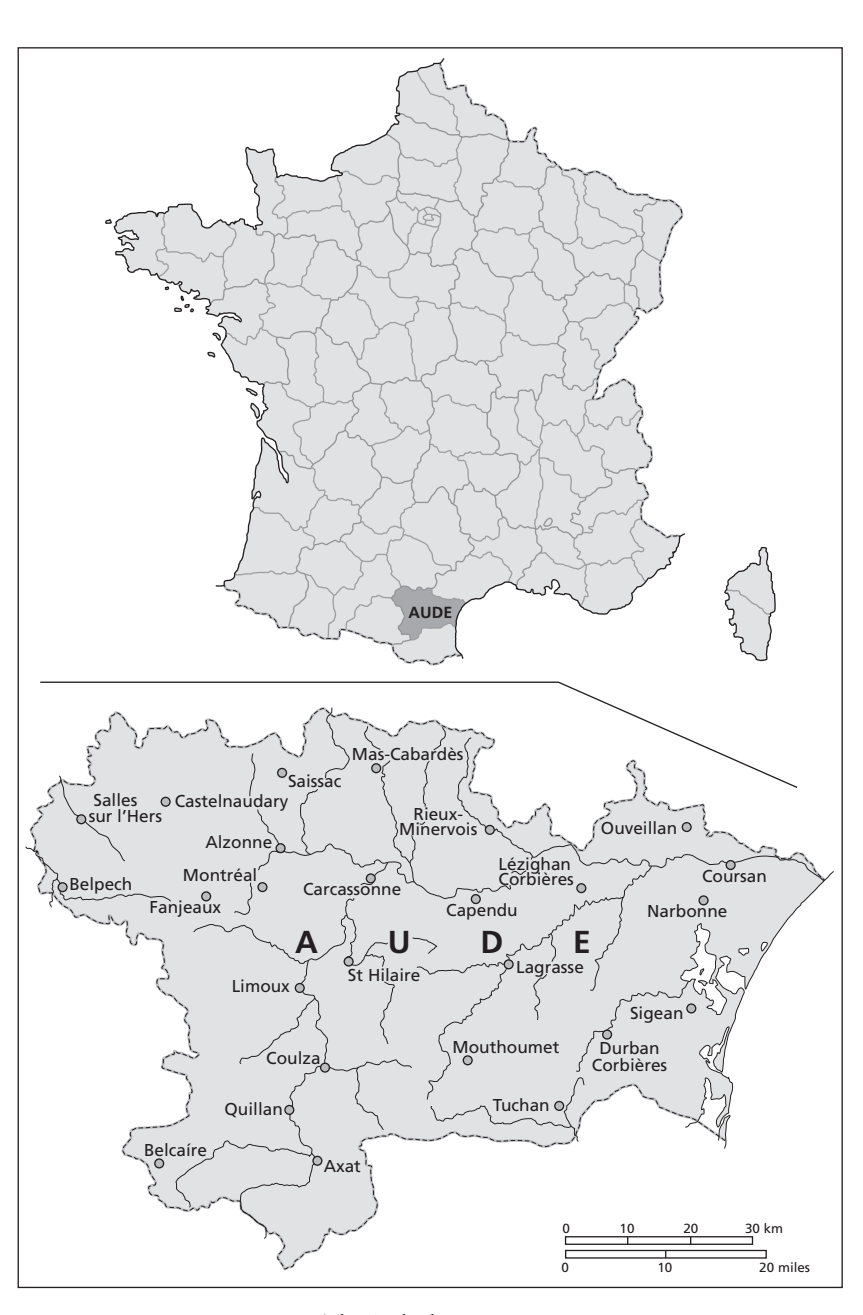
Map 2 The Aude department in France