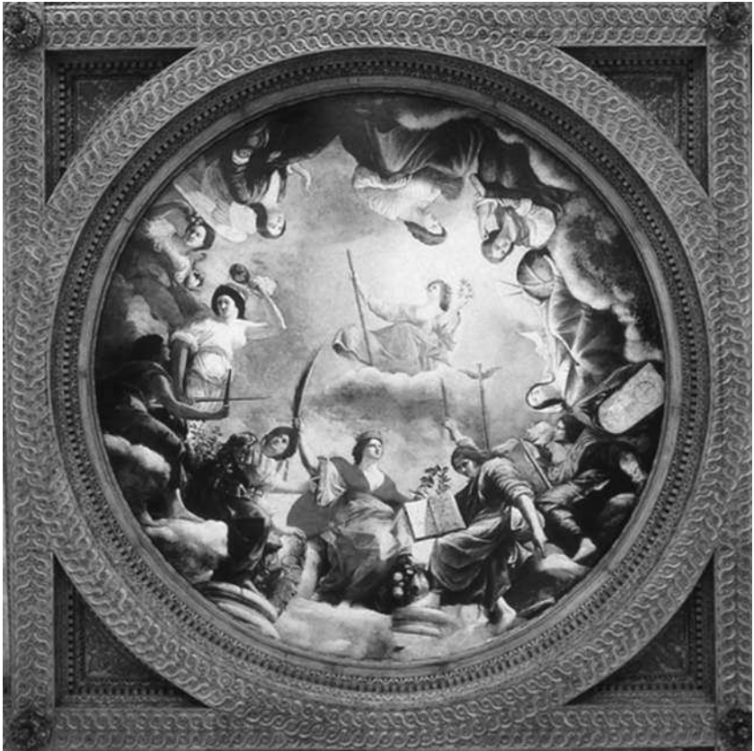
Frontispiece. Detail from 'An Allegory of Peace and the Arts'. Orazio Gentileschi. Marlborough House, c. 1635–8.