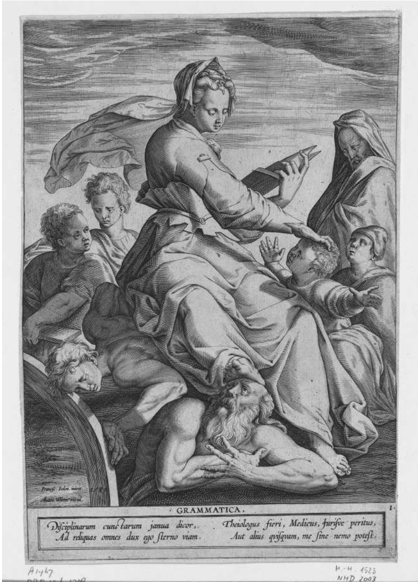
Figure 2. Antonie Wierix II, 'Grammatica'. Antwerp, 1592. Hollstein Dutch 2003.