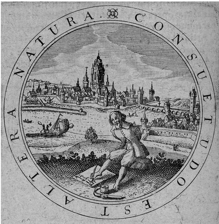
Figure iii Custom as second nature ( consuetudo est altera natura ), from Jacobus Borritius, Emblemata ethico-politicorum (Heidelberg: Bourgeat, 1654) emblem 45.

jurisprudence if we appreciate properly that the emblem shows another quill awaiting the writing of the left foot.