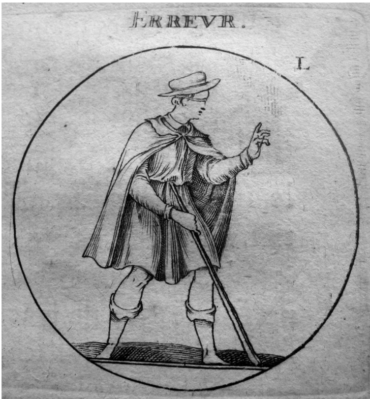
Figure iv Error ( erreur ), from Cesar Ripa, Iconologie ou les principales choses qui peuvent tomber dans la pensee touchant les Vices et les Vertus, sont representes sous diverses figures (Jean Baudoin edn, Paris, 1643) at 59. (Permission granted, P. Goodrich.)

allegorical, moral, and spiritual meanings to this depiction of an erring and blind pilgrim. The allegorical meaning is that of the human journey, of the path that we cannot see in the shadow of the valley of death, with merely mortal eyes. Figuratively we are all blind, we are all incapacitated, we are all on a journey, seeking truth and salvation. The allegory is that of the passage from image to an imageless eternity, from darkness to light. This expands into the moral meaning, which is that the senses cannot be trusted, that faith and not sight will direct us to the true path. Common in depictions of justice, blindness here is a species of injunction, both a punishment for being distracted by sight and by the senses, by worldly things, and an exhortation to trust what cannot be seen, what in theological terms has no being and is not, namely divinity.