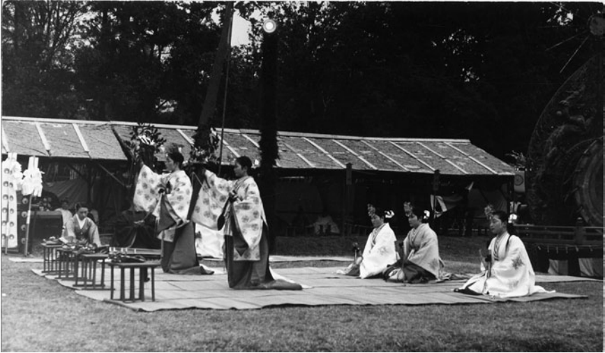
Fig 3 Miko channel gods and purify the stage at the Wakamiya Festival, Kasuga Shrine, Nara.

In the introduction, a sacred fire is lit and “Niwabi” (Sacred fire) and “Ajime” (meaning unknown) are sung to purify the venue. The lyrics of “Ajime” employ a few unintelligible syllables, reflecting a traditional belief that a word or even the voice itself retains magico-religious efficacy. To invoke the gods, “Sakaki” (Sacred branch) and “Mitegura” (Strips of paper) are sung to praise the god’s symbols, danced by a trance-possessed leader with torimono , sacred implements acting as temporary abodes of the god. Then, a summoning of a god of Korean origin, “Karakami” (韓神), is sung and danced. The entertainment part includes several songs depicting sacred gods and local landscapes. The last song, “Sonokoma” (The horse) praises the sacred vehicle of the god.