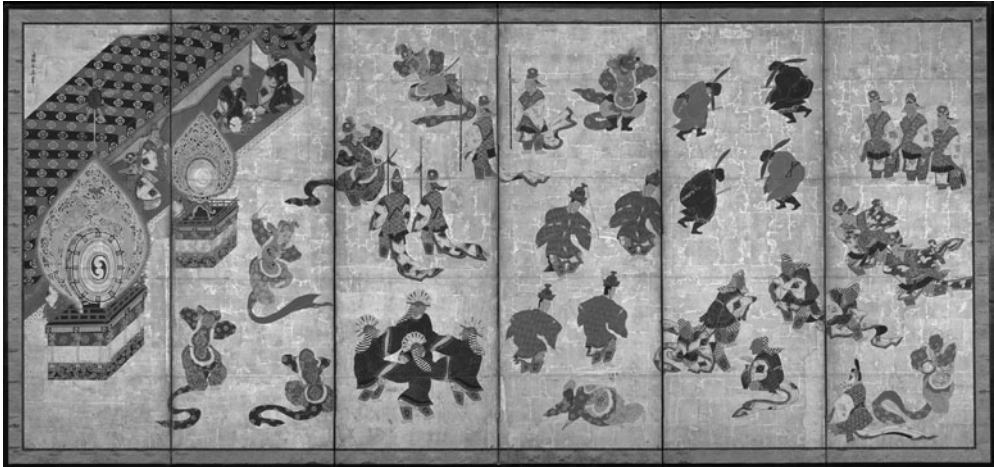
Fig 2 Six-panel painted screen by Kanō Yasunobu (1613–85), illustrating bugaku.

called tōgaku (Chinese music), and rin'yūgaku (Vietnamese music), later categorized simply as tōgaku .