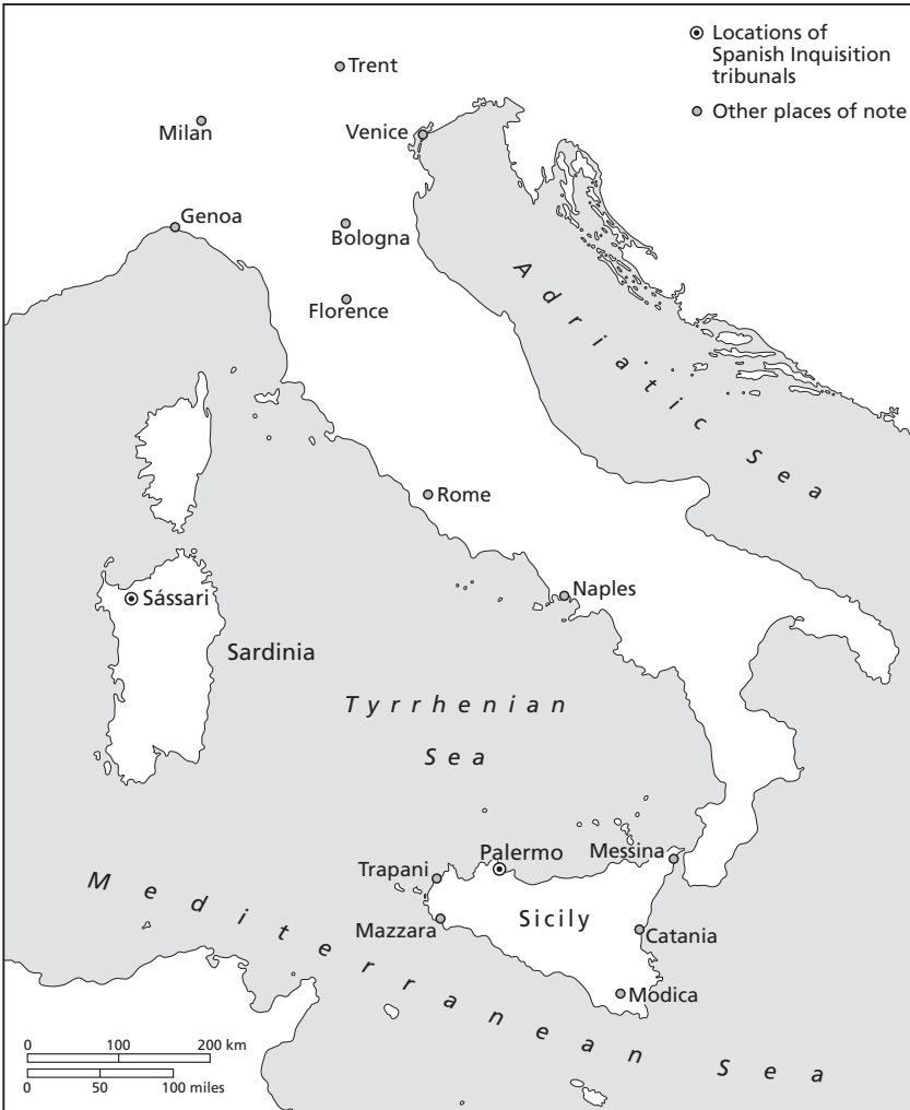
MAP 2. Spanish Inquisition Tribunals and Notable Cities in Italy