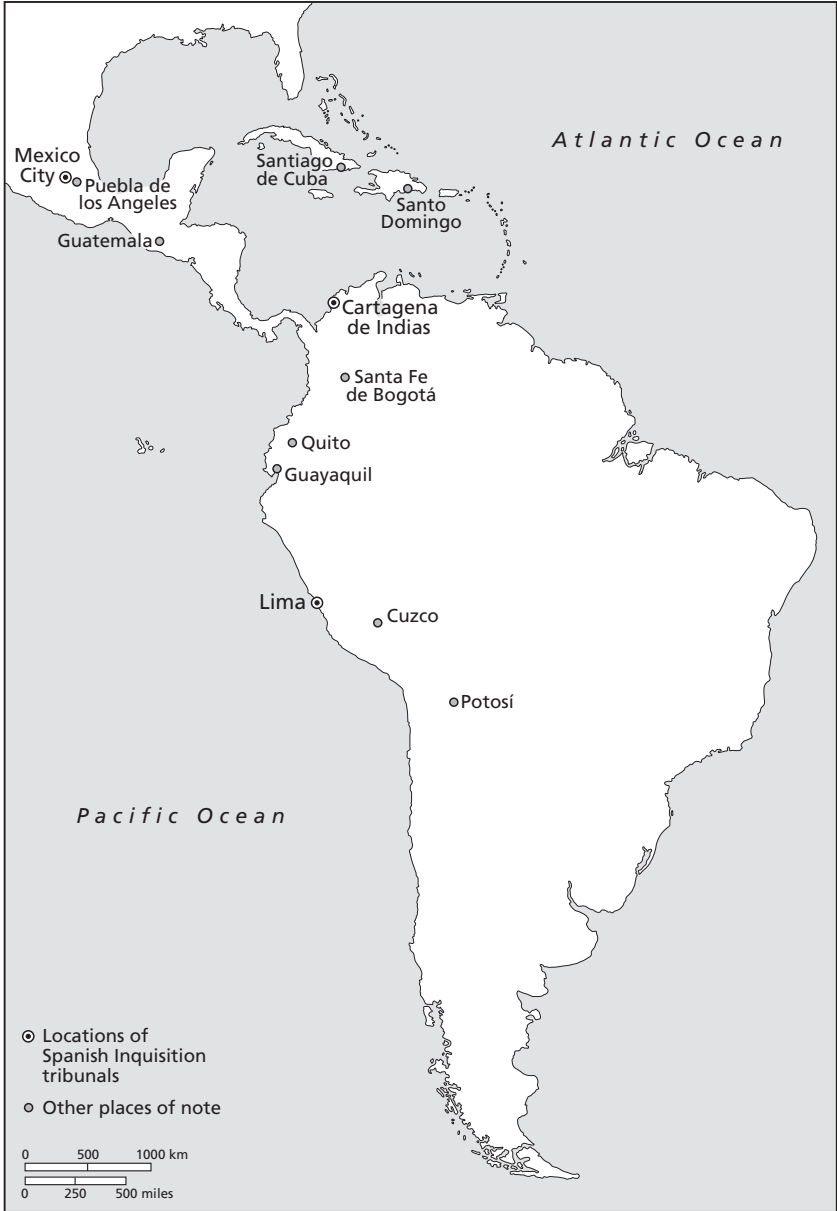
MAP 3. Inquisition Tribunals in the Viceroyalties of New Spain and Peru