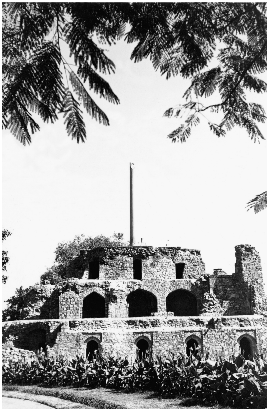
Plate 1.2 Asoka Pillar, Ferozshah Kotla, Delhi.