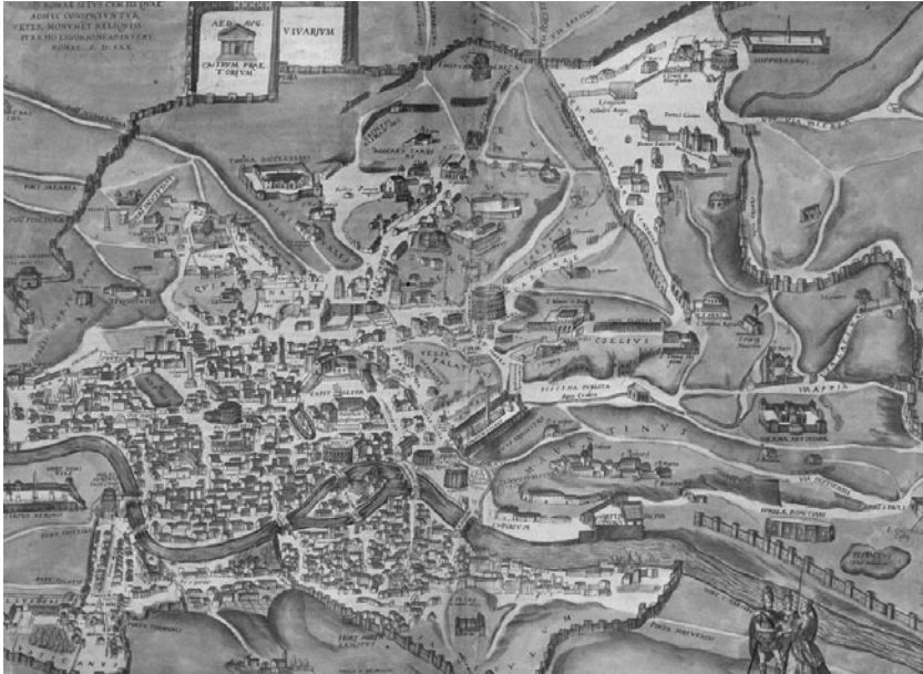
Figure 1.3 Bird's-eye view of ancient Rome by Pirro Ligorio, as printed in Braun and Hogenberg 1572–1617. See also colour plate section.

no other manmade feature, ever. 15 But even this wall can be breached – and not just by marauding invaders. 16 In contrast to Ligorio's image, the Forma urbis Romae , or Marble Plan, a map displayed in the hall, or aula , of the Temple of Peace from the start of the third century CE, marks neither geographical nor political boundaries and includes buildings beyond what will be embraced by Aurelian's perimeter. 17 Although invaluable for anyone studying urban topography, the Marble Plan is not a map as we would understand it, but a monument or exhibit, recently described as 'offering a hyper-abundance of cartographic information designed to overwhelm the viewer'. 18 Its Rome is its buildings, and its buildings are a chequerboard covering a hundred and fifty marble slabs. In recording the ground plans of