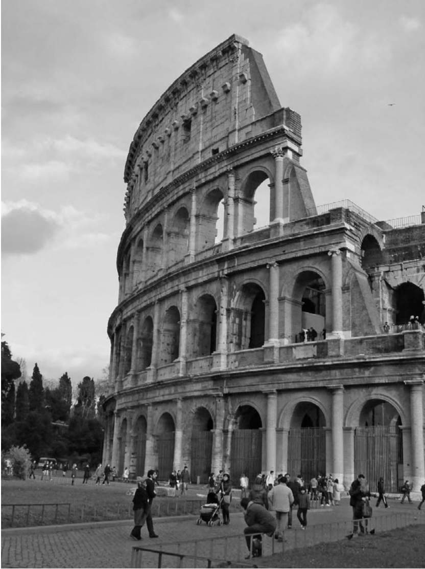
Figure 1.2 The Colosseum, Rome.

the amphitheatre rises in full view, were Nero's lakes . . . Rome is returned to herself. 10 The Colosseum too was able to function as a metonym.