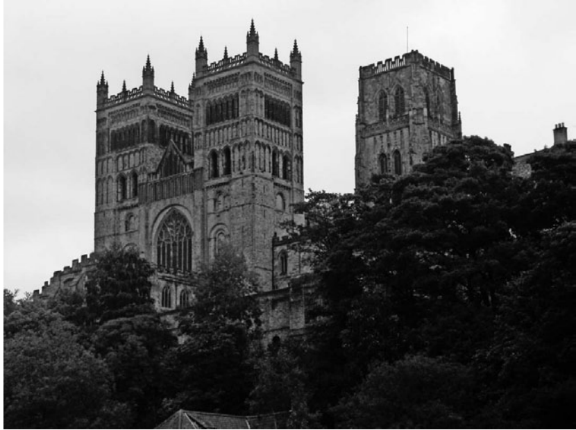
Figure 1.1 The Cathedral, Durham City.

their marching momentous. Seven hills lend gravitas to Pierre's account, turning struggle into an image of triumph.