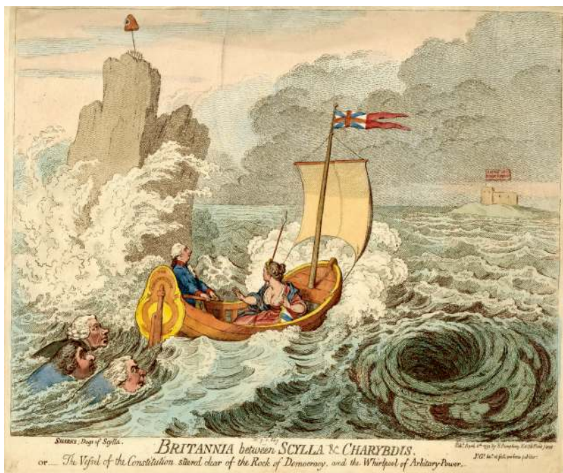
Figure 0.2 “Britannia between Scylla and Charybdis”, James Gillray, 1793. The three sharks with human heads (Richard Brinsley Sheridan, Charles James Fox and Joseph Priestley) closely pursue the boat.

Strait of Messina between Scylla and Charybdis. The latter two are mythological sea monsters trying to kill Odysseus and his companions. A relevant detail in the story is that Charybdis lurked under a fig tree, the roots (hence rhiza) of which would assist Odysseus to pass. Later interpretations referred to Scylla as a rock and Charybdis as a whirlpool. In English, rhiza obtained a nautical translation as a hazard of sailing along rocky coasts. Nowadays, being “between Scylla and Charybdis” means being caught between two equally unpleasant alternatives; related to the advice “to choose the lesser of two evils”. An excellent depiction of this interpretation is to be found in James Gillray’s 1793 political cartoon “Britannia between Scylla and Charybdis”; see Figure 0.2. In the picture, on the summit of Scylla is a