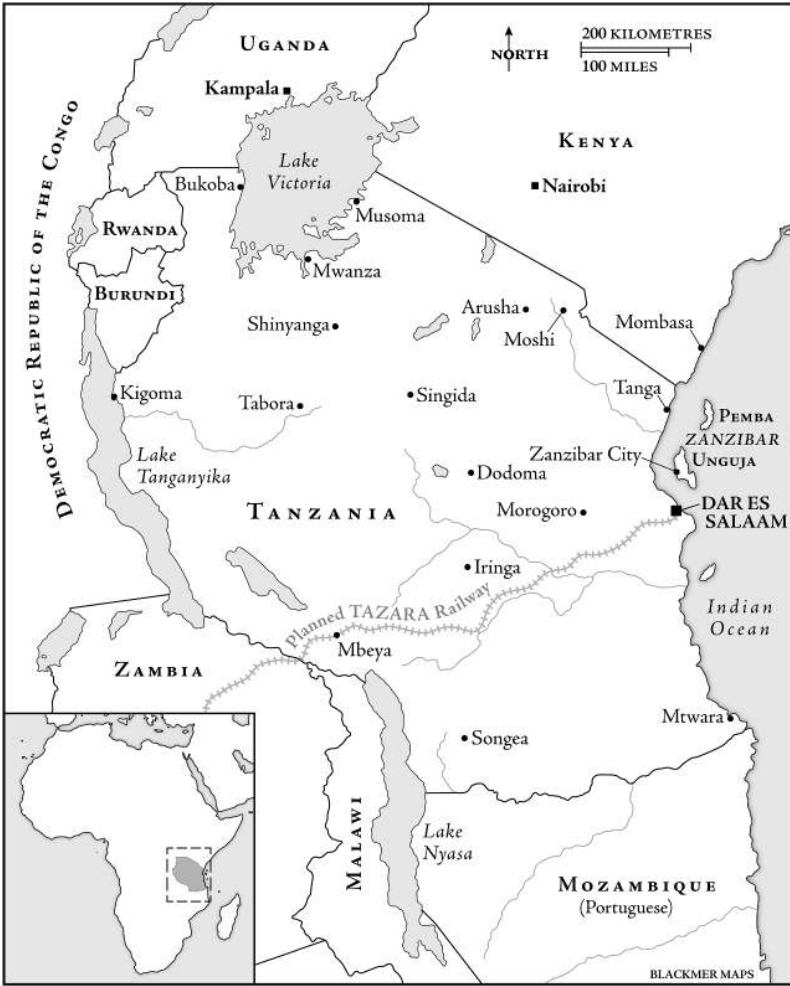
Map 1.1 Tanzania and its neighbours, circa 1968.