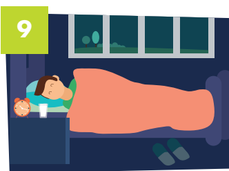
go to bed