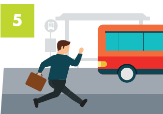
catch the bus