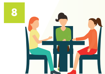
relax with friends