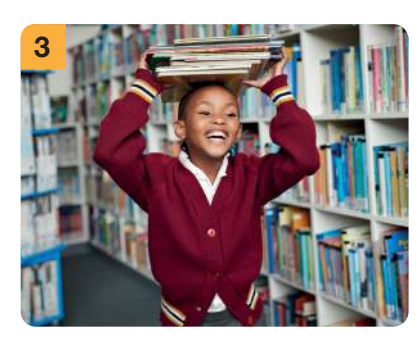
I _____a student. I _____a teacher.