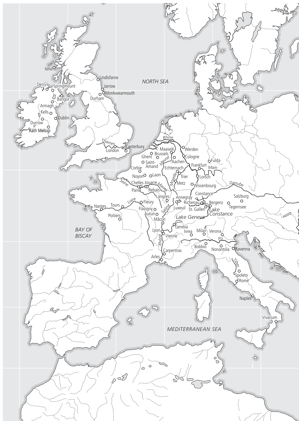
Figure 0.1 Sites associated with manuscript production. Joe LeMonnier, https://mapartist.com/