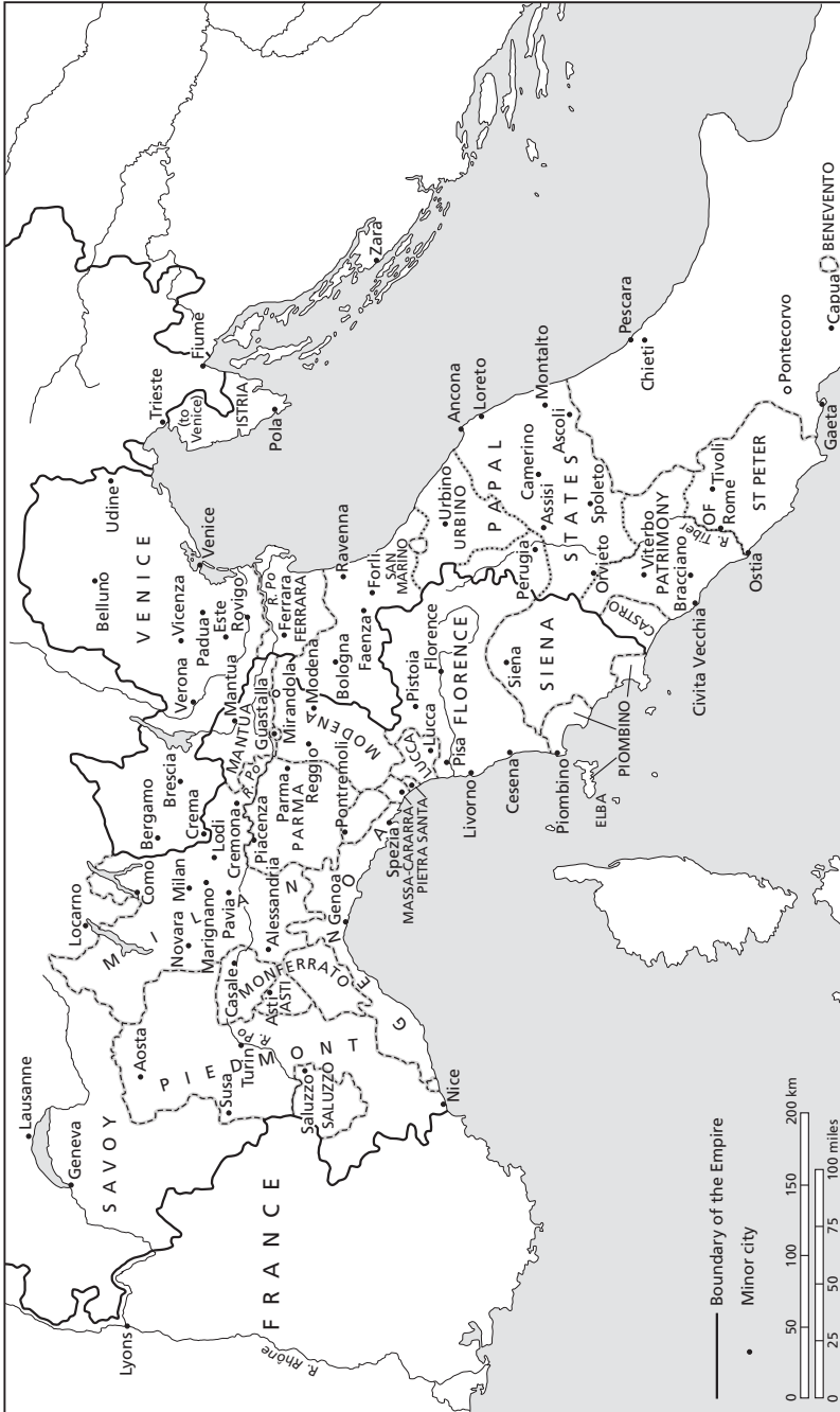
Map 1 Northern Italy in the sixteenth century; from Iain Fenlon, Music and Patronage in Sixteenth-Century Mantua , 2 vols. (Cambridge, 1980), I, xiv; reproduced with permission