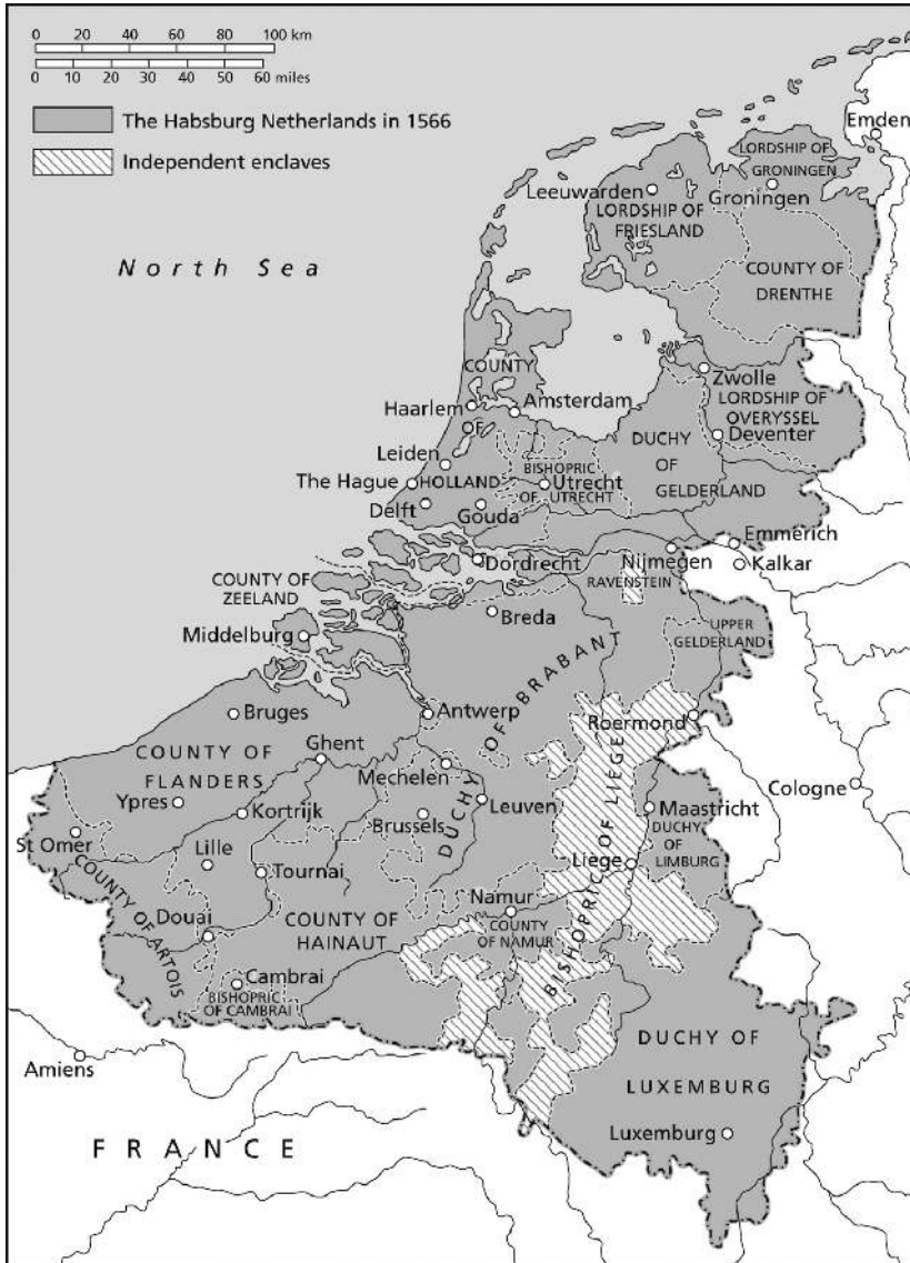
Map 4 Habsburg Low Countries, 1566; from Geert Janssen, The Dutch Revolt and Catholic Exile in Reformation Europe (Cambridge, 2014), xiii; reproduced with permission