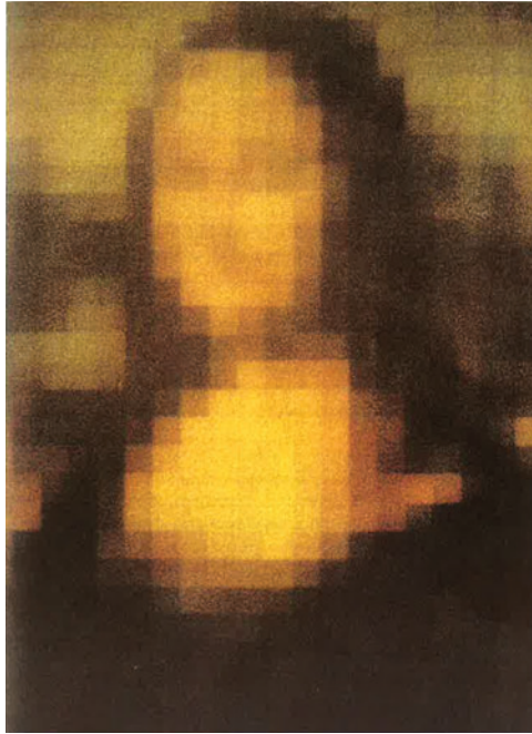
Figure 3 At some intermediate distance from the picture everyone will recognize the Mona Lisa. Up close the image disappears – it turns out to consist of 560 monochromatic squares distributed in a particular way. However, at large distances the image naturally disappears again. This is an example of an “intermediate asymptotic” consideration, which will be basic in our presentation.

computations. These results should be processed and attempts made to extract from them some general laws.