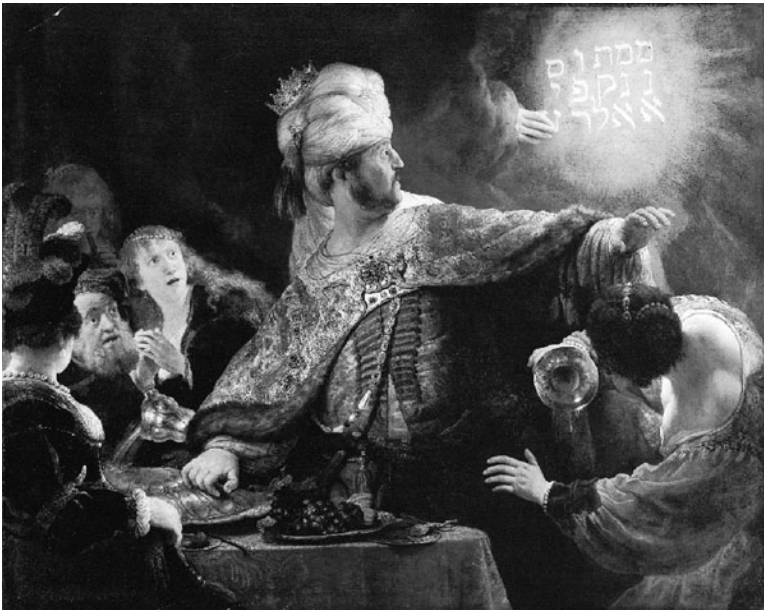
Rembrandt, Belshazzar's Feast (c.1635)

This human tendency to insert narrative time into static, immobile scenes seems almost automatic, like a reflex action. We want to know not just what is there, but also what happened. Artists have often capitalized on this tendency. In the renaissance, it was common to depict a moment in a well-known story from mythology or the Bible. In the painting below by Rembrandt, we see action in progress. The painting draws on the Old Testament story of Belshazzar's feast, told in the Book of Daniel (Chapter 5). Belshazzar, the last king of Babylon, arranged a great feast and ordered that the golden vessels that his father, Nebuchadnezzar, had plundered from the temple in Jerusalem be set out and filled with wine. At the height of the feast, when his princes and wives and concubines were drinking from the holy vessels, a divine hand suddenly appeared and wrote on the wall mysterious words in Aramaic ("Mene mene tekel upharsin"). Belshazzar was struck with fear. Eventually, Daniel was called for to interpret the words, which he did: "Thou art weighed in the balance, and found wanting." That very night, Babylon fell to Darius, and Belshazzar was slain. In his painting, Rembrandt has caught the climax of the narrative: the moment when Belshazzar, with less than twenty-four hours to live, sees