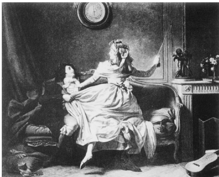
Michel Garnier, La douce résistance (1793).

But even when we don't already know the specific story depicted in a painting, we can still be tempted to look for a story. We have many narrative templates in our minds and, knowing this, an artist can activate one or another. Looking at the painting below by Michel Garnier, is it even necessary to prompt ourselves to ask what is happening? It would appear, in fact, that we begin right away, in the act of perception itself, to answer this question. We may never know who is being depicted or what specific story they may be a part of. But we do, nonetheless, have narrative formulas stored in our memory that quickly fill in certain elements of the story so far. That the young woman was playing her instrument is indicated by the fact that she still holds the bow in her right hand. Indeed, that she still holds it tells us that things are happening fast. And we have a very good sense of how the young man, now pulling hard on her dress and looking imploringly, must have been feeling a few moments ago during