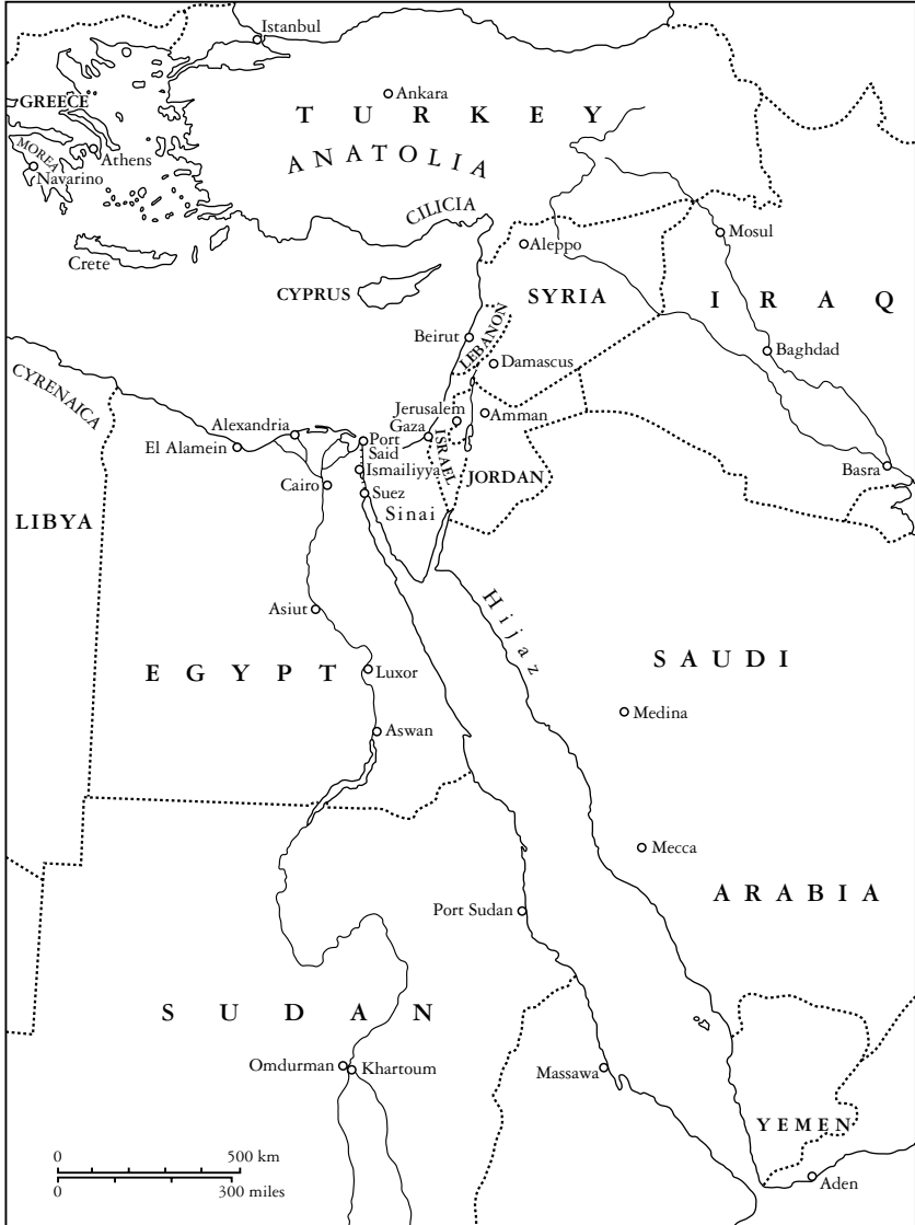
MAP I Egypt and its neighbours