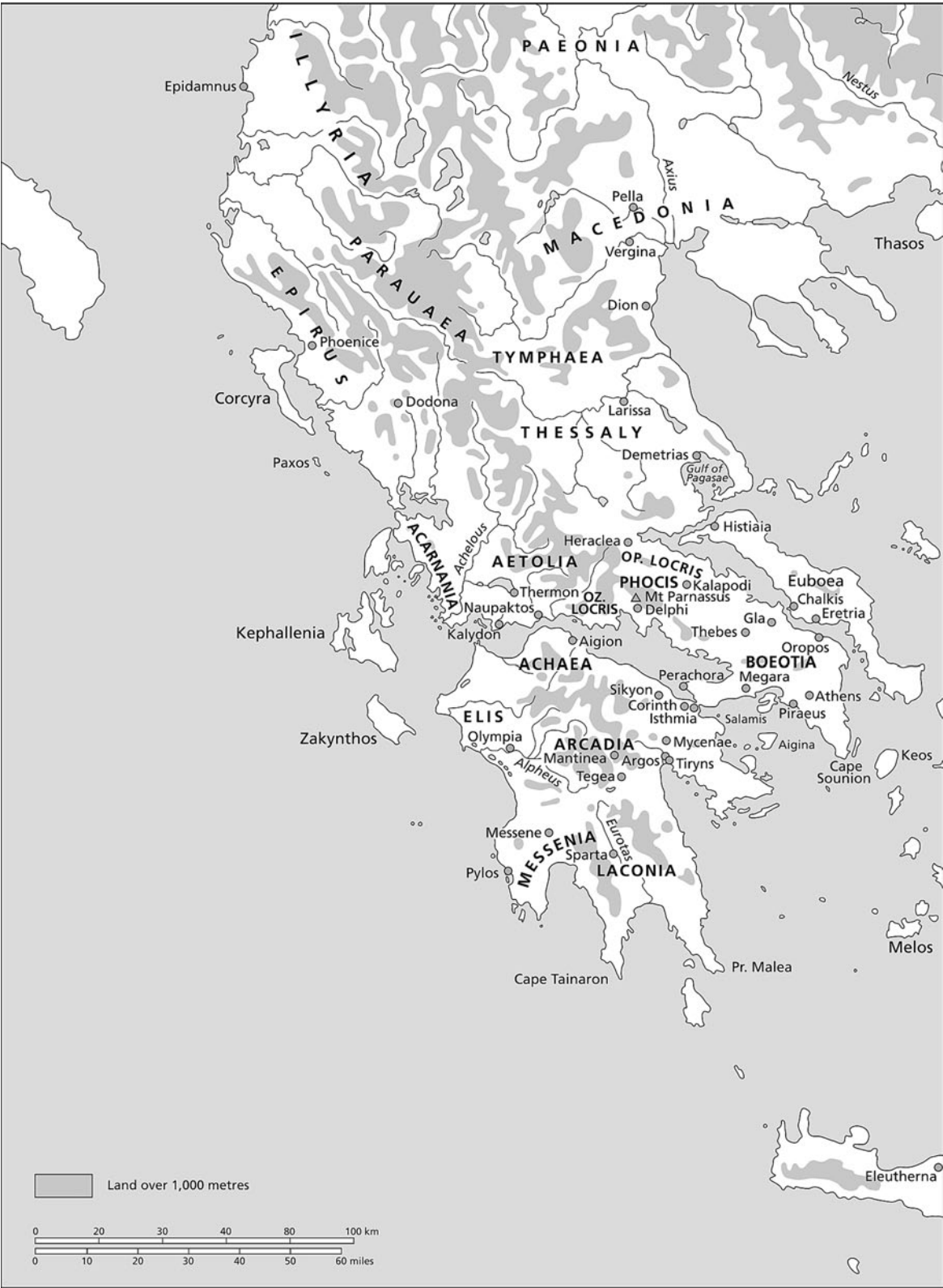
Map 2 (above and facing page) Greece and Asia Minor: Bronze Age and Archaic period