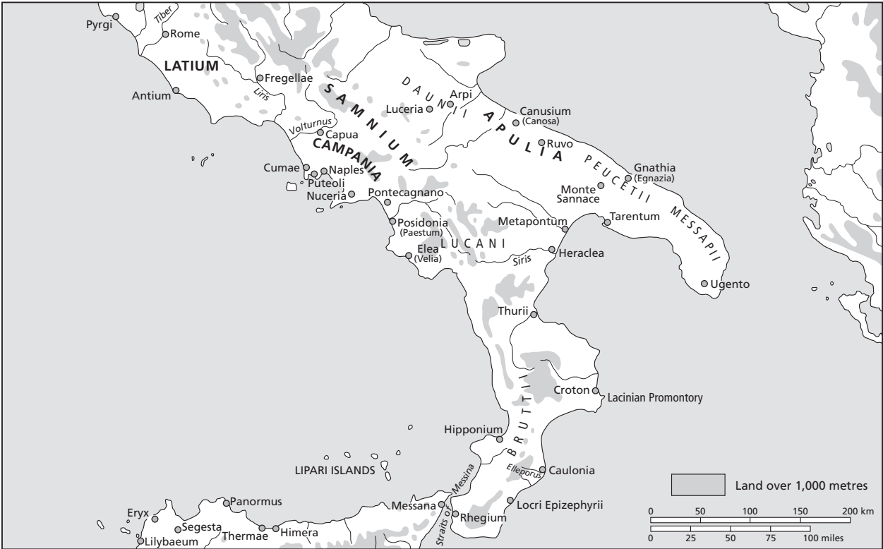
Map 6 Southern Italy