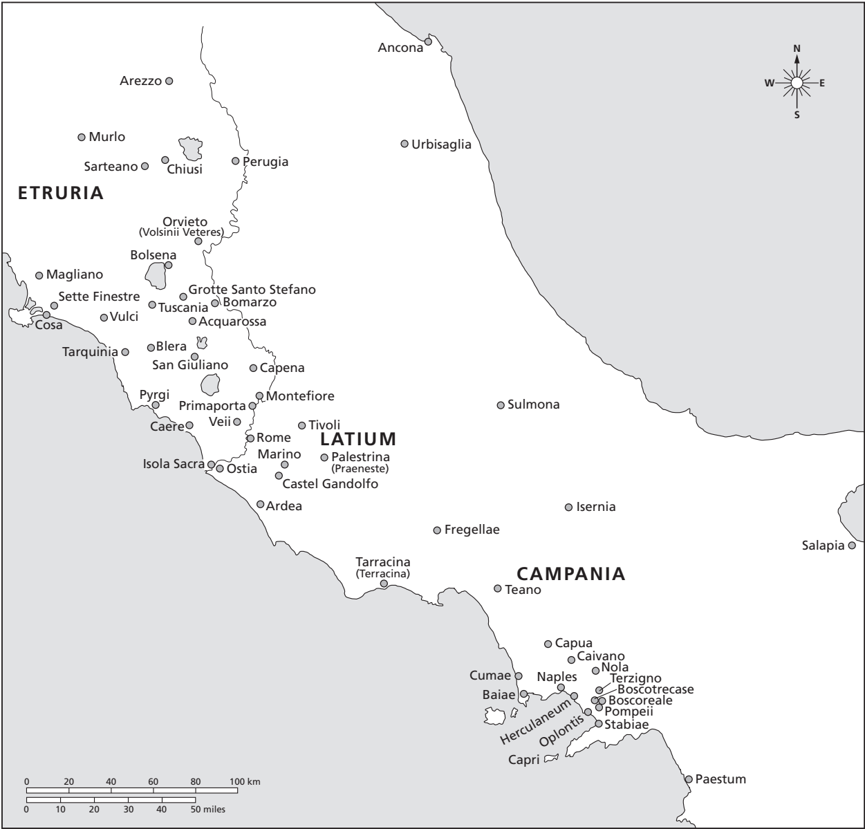
Map 3 Central Italy: Etruria, Latium, and Campania