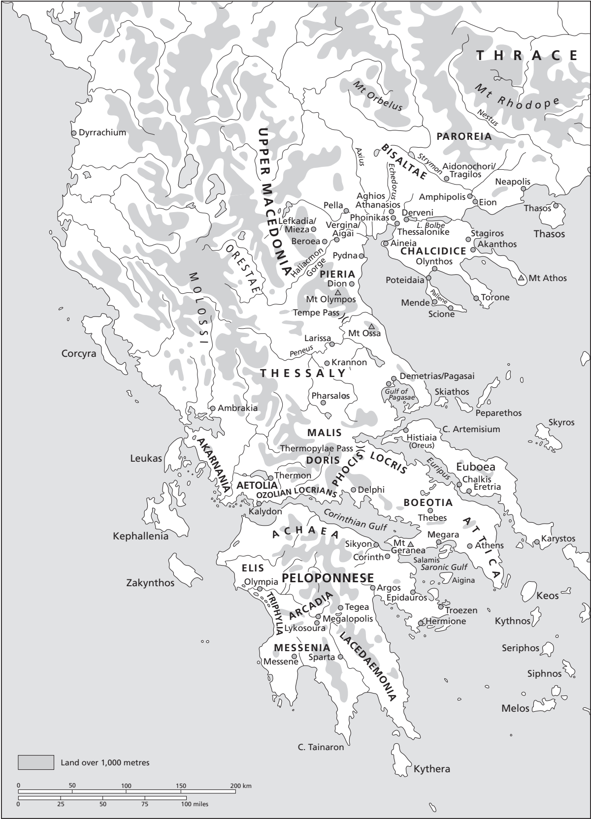
Map 4 Greece and Macedonia in the Classical and Hellenistic periods