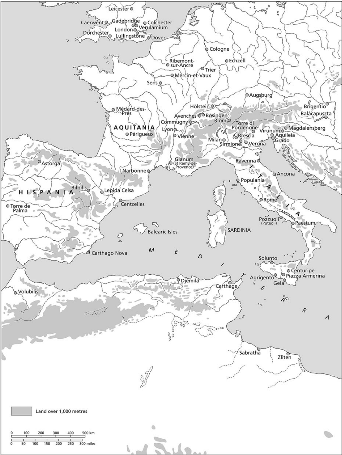
Map 5 (above and facing page) The Hellenistic world and the Roman Empire