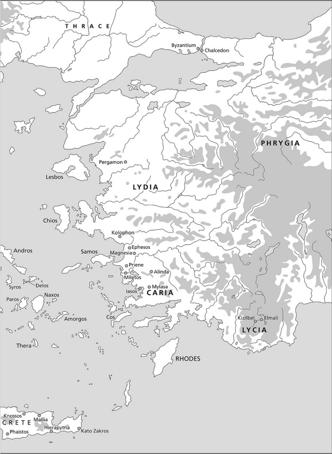
Map 2 (cont.)