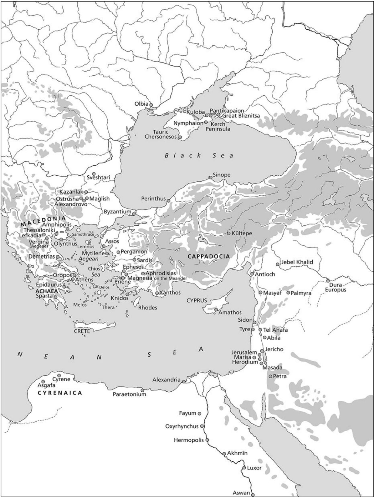
Map 5 (cont.)