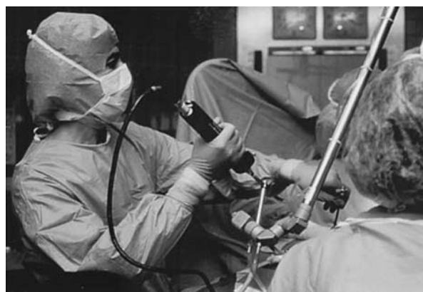
Figure 1.4. Camran Nezhat doing videolaparoscopy in early 1980.

To overcome these inherent deficiencies standing in the way of the new technique, Nezhat began a fruitful relationship of collaboration with Karl Storz and other surgical instrument companies.