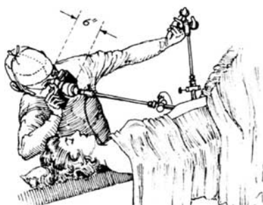
Figure 1.1. Surgeon with old laparoscopic setup still being published in laparoscopic books in the 1980s. Picture adopted from Textbook of Laparoscopy by Jaroslav Hulka, 1985.

With camera attached, the surgeon's head and body are 4" to 6" farther away from his instruments: surgical reach is awkward.