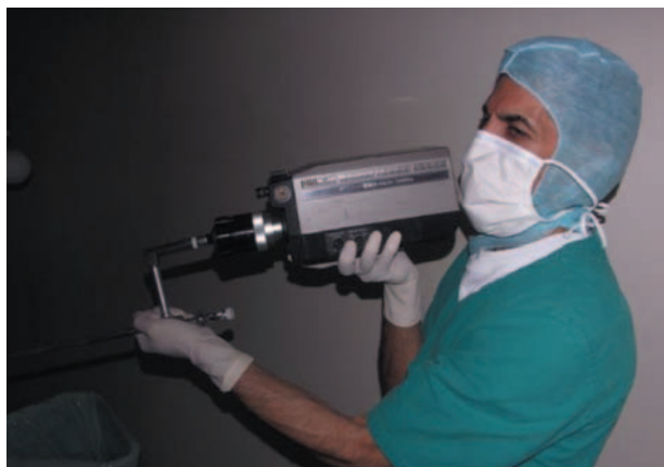
Figure 1.3. One of the first cameras used for video-laparoscopic surgery by Cameron Nezhat, MD.

founder of the AAGL, Jordan Phillips, whose 1977 report outlining in stark detail the estimated complication rates associated with laparoscopic tubal sterilizations struck a raw nerve within surgical communities and served for a time to temper enthusiasm. [30] Indeed, failed sterilizations became the second leading cause of lawsuits for ob-gyns in the United States, only after those associated with pregnancy complications. [31]