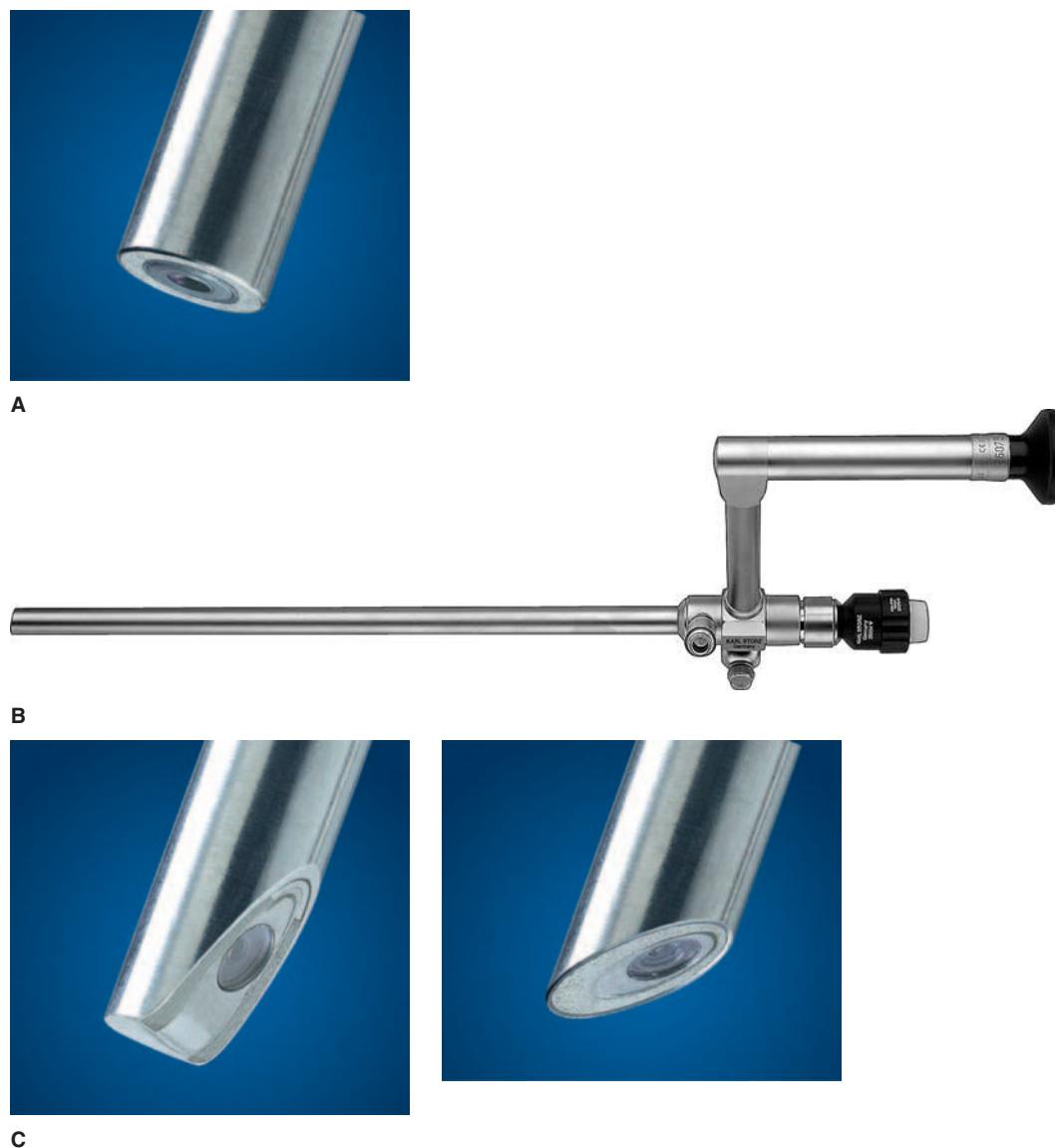
Figure 2.1. (A) A 5-mm straight diagnostic laparoscope. (B) A 10-mm diagnostic laparoscope. (C) Angled laparoscopes.

10 — Jaime Ocampo, Mario Nutis, Camran Nezhat, Ceana Nezhat, and Farr Nezhat