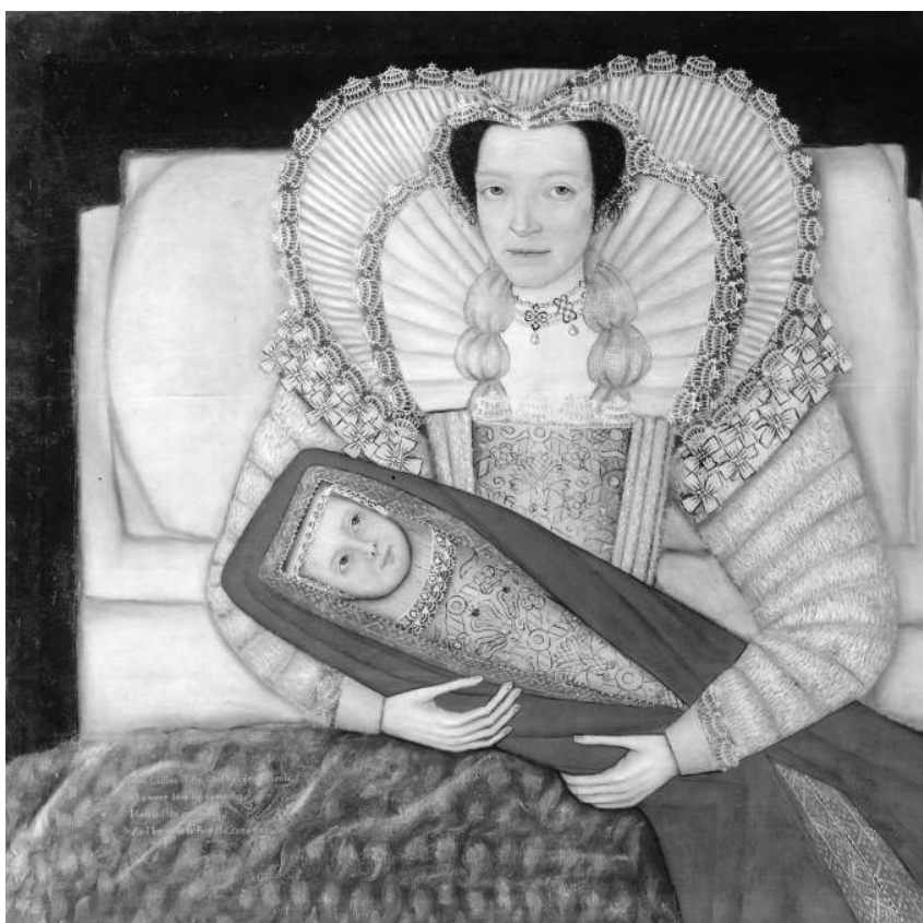
1. The Cholmondeley Sisters