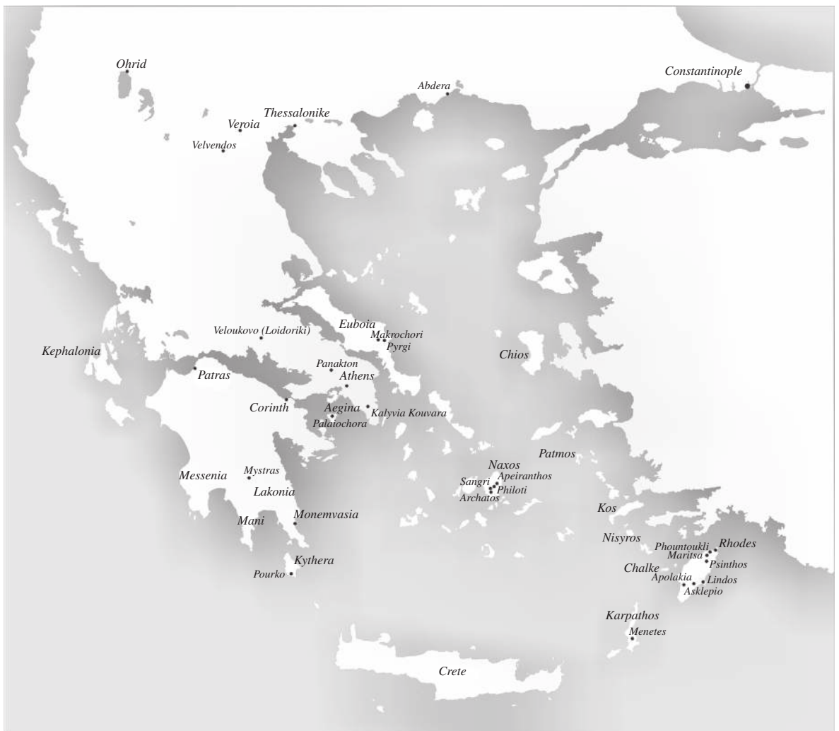
Map 1. Sites in Greece mentioned in the volume