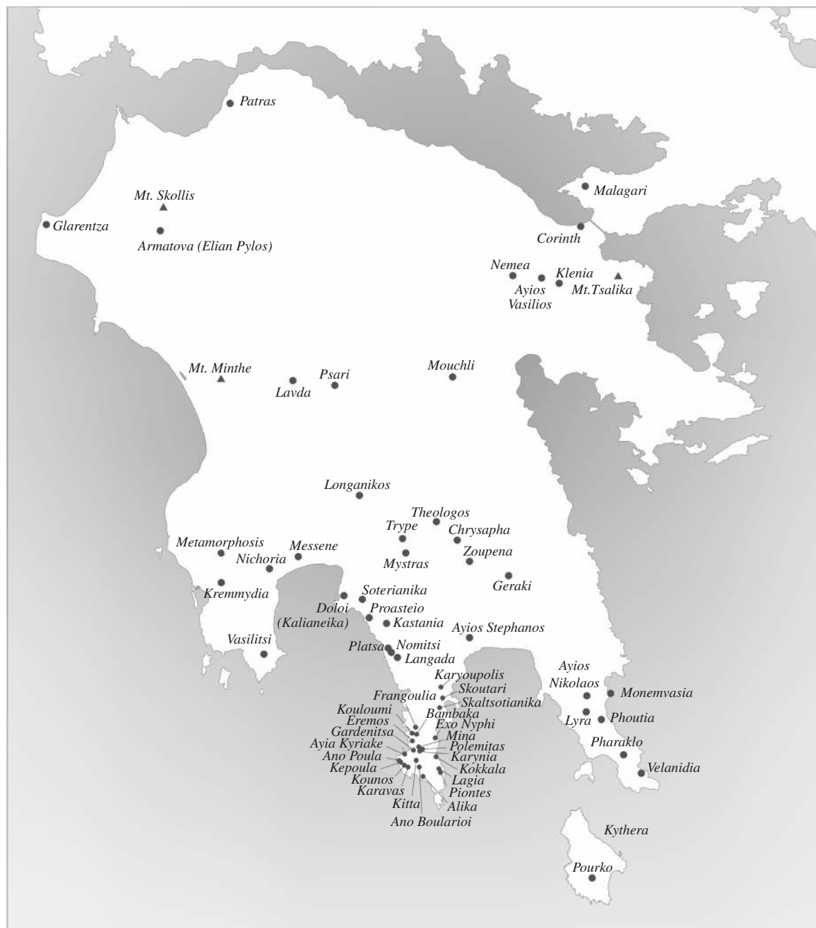
Map 2. Sites in the Peloponnese mentioned in the volume