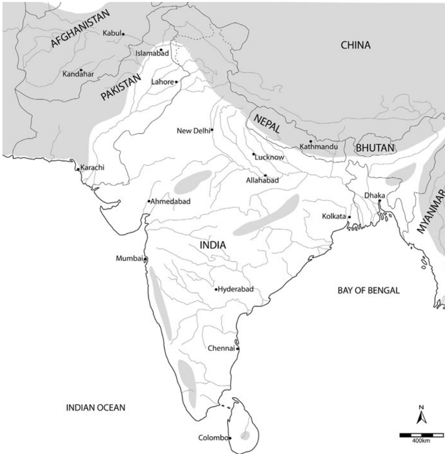
Figure 1.1. Map of South Asia showing modern nation states.

settlements belonging to the period between the two, which has frequently been presented and interpreted as a distinct cultural, political and social transformation. We have chosen to do this for two main reasons. The first is that there were many similarities in the internal sequences and cycles of both these developments and the time lapse between them has now been reduced to a matter of centuries. The second reason is that research now establishes clearly that the origins of both the Indus and the Early Historic urban-focused developments were much older and that both developed far more slowly than has often been presented in the past and, as such, have formed distinct traditions. Within this volume, we will also explore a range of different theories about state formation and social organisation in relation to South Asia, and then test them against a range of archaeological and, where appropriate, historical evidence. This process will serve to demonstrate how much our understanding