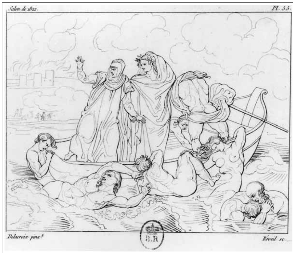
8. Achille Réveil, after Delacroix's Dante and Virgil , 1822. Engraving from C. P. Landon, Annales du Musée et de l'Ecole moderne des Beaux-Arts. Salon de 1822 (Paris, Imprimerie royale, 1822), Plate 55.

contrast with the ephebic male nudes and the anacreontic classicism of the period. How turgid and intense are Delacroix's figures in comparison with the preternatural smoothness of Pierre-Claude-François Delorme's Cephalus and Aurora (Fig. 9), also of 1822! The comparison is more meaningful than immediately apparent, given the origins of Delorme's work: based overtly on Pierre-Narcisse Guérin's painting of the same subject from 1810, Delorme's painting appeared in the same Salon as Delacroix's. The Dante could, then, also be compared indirectly with the work of Delacroix's own teacher, Guérin. Recent research by Thomas Crow, Abigail Solomon-Godeau, and Carol Ockman shows that the practice and meaning of classicism were undergoing radical changes and reinterpretations in this period. In this circumstance, Delacroix's own engagement with tradition in this painting takes on specific import.