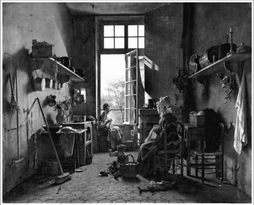
1. Martin Drölling, Kitchen Interior , 1815. Oil on canvas, 65 × 80.8 cm. Paris, Musée du Louvre.

A spate of deaths were soon to come. Pierre-Paul Prud'hon died in 1823 and Théodore Géricault and Anne-Louis Girodet in December 1824. David died in exile in 1825. The death of so many artists produced a kind of vacuum.