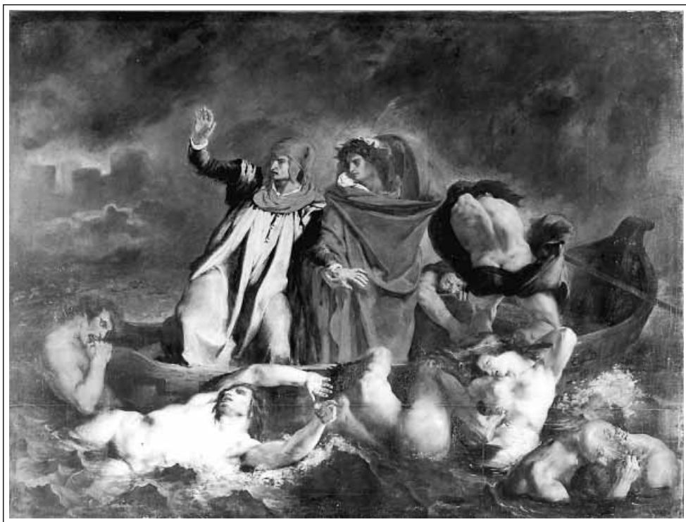
2. Eugène Delacroix, Dante and Virgil, 1822. Oil on canvas, 189 × 246 cm. Paris, Musée du Louvre.

Given this deracinated state of the Restoration art world, it is of interest that Delacroix's first public painting, Dante and Virgil , deals with the theme of artistic paternity. In its embrace of the master genre, history painting, through an homage to masculine predecessors, it nonetheless simultaneously resists discipleship to David and other Neo-Classical "masters" and defies what could be seen as an incipient feminization of painting.