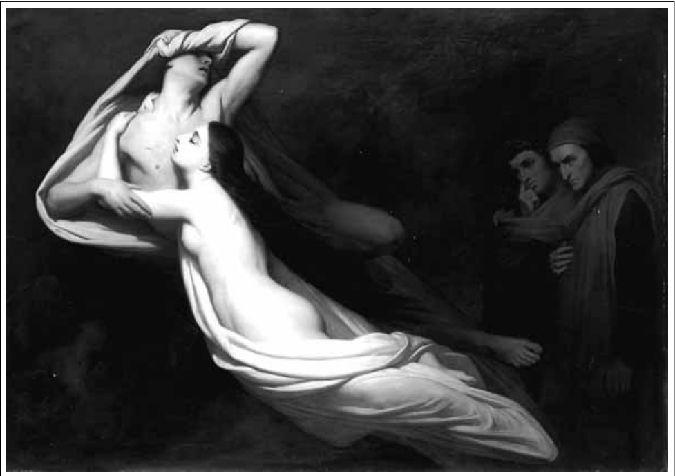
3. Ary Scheffer, Francesca da Rimini and Paolo Malatesta Appearing to Dante and Virgil , 1855 (copy of version exhibited in 1822). Oil on canvas, 171 × 239 cm. Paris, Musée du Louvre.

The register of Delacroix's solicitation of tradition is immediately evident in two aspects of the work. Based on Canto VIII of Dante's Inferno , the first part of the Divine Comedy , the literary subject signals the seriousness