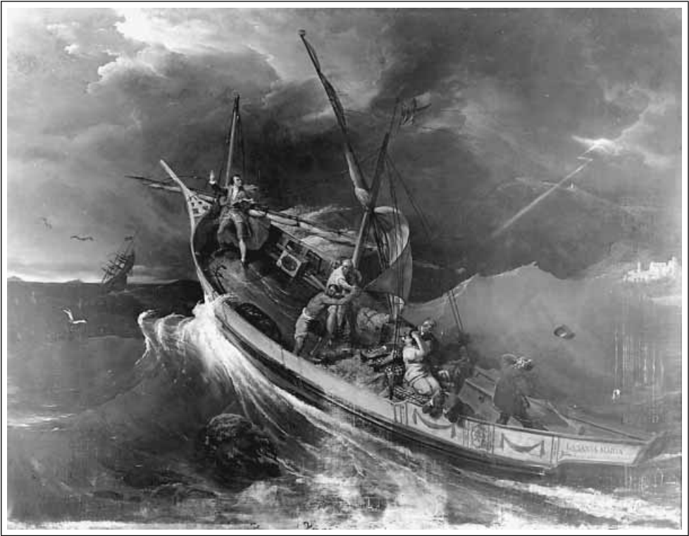
12. Horace Vernet, Joseph Vernet Attached to a Mast Studying the Effects of a Storm , 1822. Oil on canvas, 275 × 356 cm. Avignon, Musée Calvet.

of 1822, Horace Vernet's Joseph Vernet Attached to a Mast Studying the Effects of a Storm (Fig. 12), 46 a different type of painting altogether.