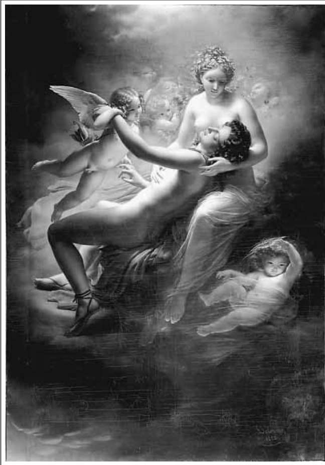
9. Pierre-Claude-François Delorme, Cephalus and Aurora , 1822. Oil on canvas, 225 × 152 cm. Sens, Musée Municipal.

In contrast to Delorme's and Guérin's classicism, Delacroix's painting is encoded with the signs of a hypervirility. (Indeed, Delacroix probably executed the sole female figure in the painting after a male model. 40 ) As I will argue, this virility is central to the renewal of painting tradition that the Dante proposes and is connected to the homage Delacroix pays to his predecessors. In the massive bodies, composition, and subject of his Dante , Delacroix was announcing his ambition through his affiliation with serious, prestigious artistic predecessors.