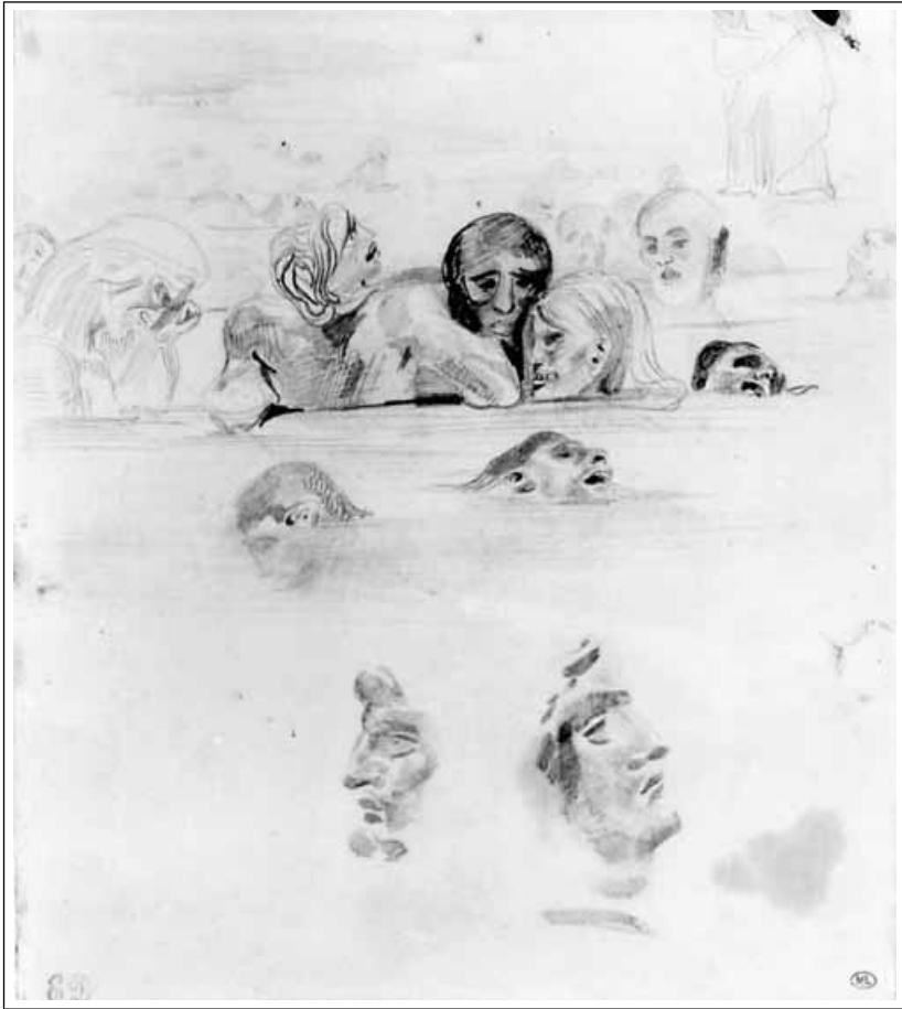
4. Eugène Delacroix, preliminary study of heads for Dante and Virgil . Pencil on paper, 27 × 20.1 cm. Paris, Musée du Louvre.

of Delacroix's painting and its claim to the status of history painting. Yet unlike Ary Scheffer's Paolo and Francesca (Fig. 3) of the same year, also drawn from the Inferno , Delacroix's evocation of the horrific atmosphere of the river Styx works as a kind of defiance, with its gloomy and unappealing mode. That is, it deals with the center of narrational history painting – tension, duress, challenge – not dream, reverie, and allegory, as does Scheffer's. (The difference of course has to do with the distinct passages chosen by each artist.) In Delacroix's image of the damned, tension in the bulging and twisted figures is appropriate to the theme of eternal hell and is brought out by grotesque gripping, clenching, and biting. The scene seems to pick up on what Chateaubriand described as Dante's "poetry of torture," building