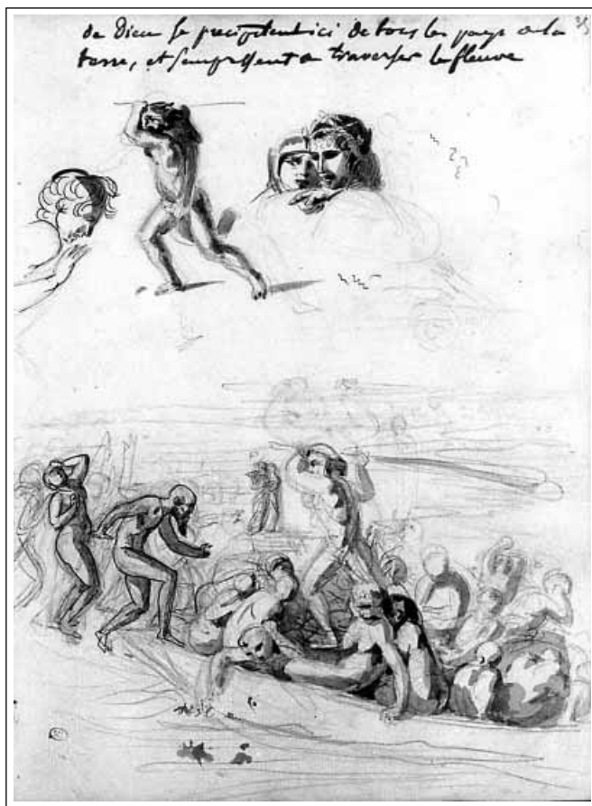
10. Eugène Delacroix, preliminary sketch of boat with oarsman for Dante and Virgil . Pen, pencil, sepia, and gray and brown wash on paper, 23.8 × 17.8 cm. Paris, Musée du Louvre.

perceived importance for the work, Michelangelo, Rubens, and Géricault, all of whom haunt the early correspondence and journal of Delacroix, along with Dante himself. The painting, Thiers opined in the exaggerated rhetoric of art criticism of the period, showed the “boldness of Michelangelo and the fecundity of Rubens,” and Gros reportedly told Delacroix, in an oft-quoted expression, that the Dante was “du Rubens châtié” (a chastened version of Rubens). 41 Figures from Michelangelo’s Last Judgment and Sistine Chapel ceiling, in particular the ignudi body type, are frequently mentioned (Johnson, Rubin, and Sérullaz), and several writers relate a preliminary sketch of a boat with oarsman to the famous segment of the Last Judgment including Charon (Fig. 10). 42 In the nineteenth century, Alfred Bruyas and Pierre Andrieu affirmed that