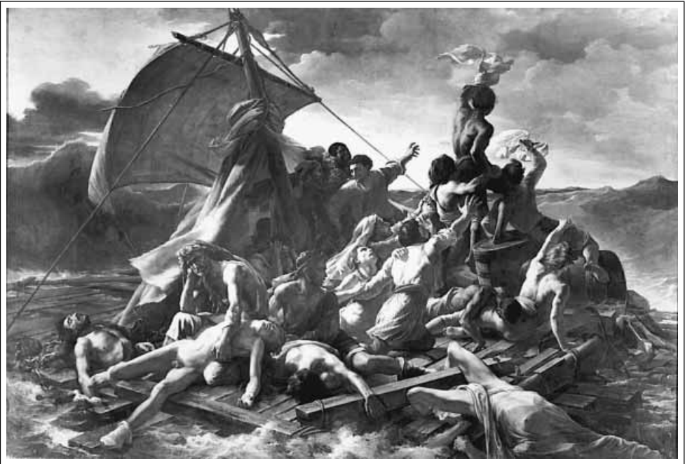
11. Théodore Géricault, Raft of the Medusa , 1819. Oil on canvas, 490 × 716 cm. Paris, Musée du Louvre.

the female figure derives from Michelangelo's Night (whose studies were also done from male models). 43 In other words, there is a long association of Michelangelo and Delacroix in the interpretive history of the Dante .