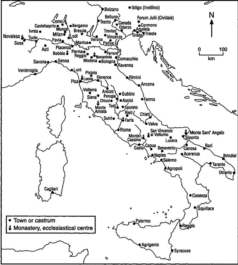
Map 1 Cities, castra and ecclesiastical centres in early medieval Italy: The Lombard period