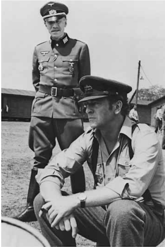
Max Von Sydow (Von Steiner) and Michael Caine (Colby) in Victory .