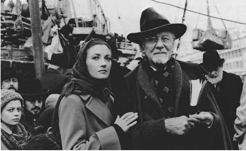
Jane Seymour and Sir John Gielgud as Natalie Jastrow and her Uncle Aaron in Herman Wouk's War and Remembrance .

PHOTO COURTESY OF JAMES GLOVUS, COURTESY CAPITAL CITIES/ABC, INC.