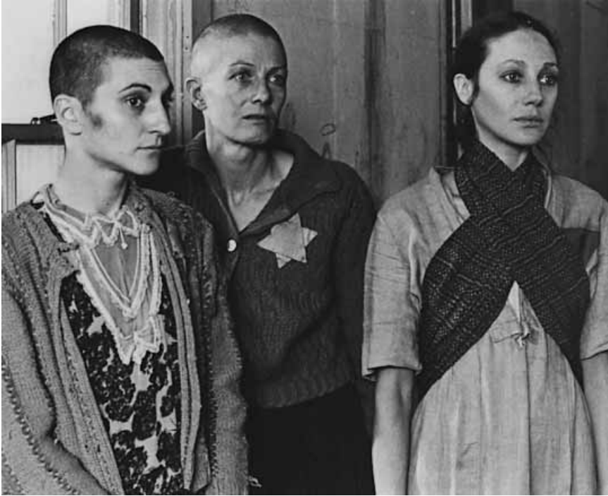
Playing for Time production photo.

Edek are hanged after escaping and being captured is effective in its silence: as the women of Auschwitz pass the pathetically dangling bodies, they remove their scarves in speechless respect.