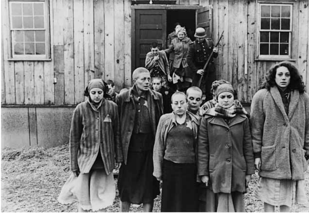
Auschwitz prisoners in Playing for Time .