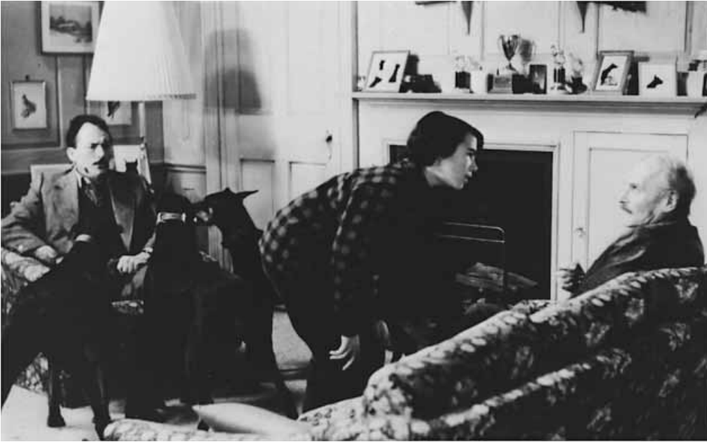
Gregory Peck (Mengele), Jeremy Black (Bobby), and Sir Laurence Olivier (Liebermann) in The Boys from Brazil .