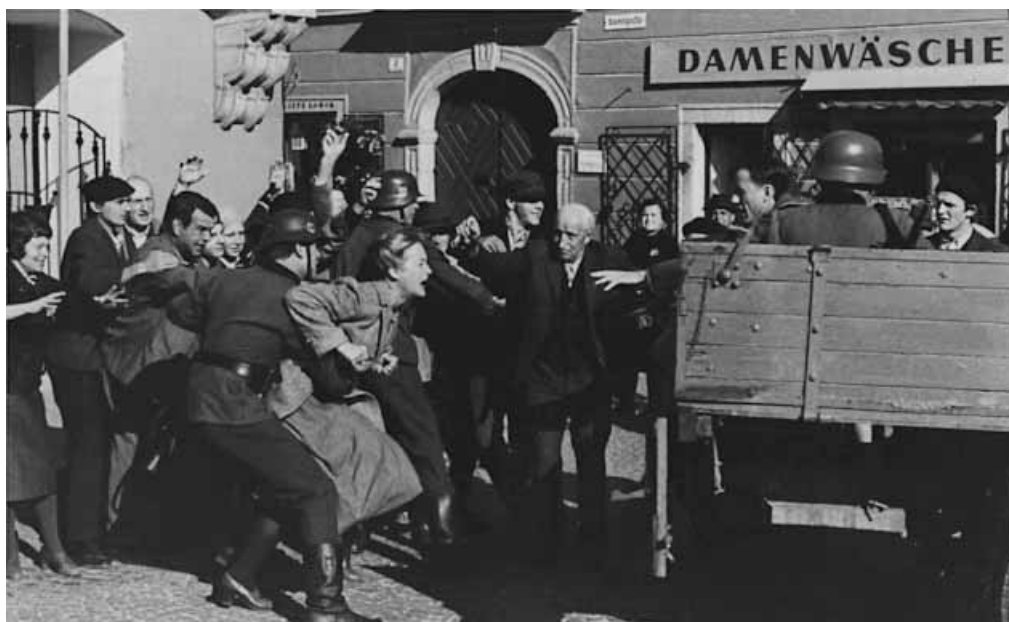
Meryl Streep (Inga) and James Woods (Karl) in Holocaust .