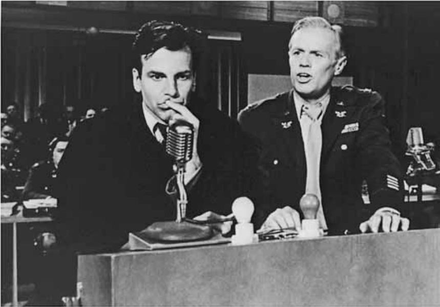
Maximilian Schell (Rolfe) and Richard Widmark (Lawson) in Judgment at Nuremberg .