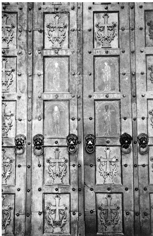
3. Bronze doors of the Cathedral of Amalfi, ca. 1061.

This book introduces a concept related to Boccaccio's act of mercantia , the art of mercantia . It reconstructs, through analyses of works of art and architecture commissioned by people involved in commerce, sophisticated episodes of lay patronage around Amalfi in the twelfth and thirteenth centuries. 4 Incorporating