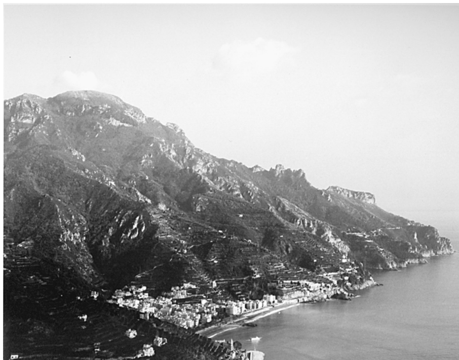
2. View of the Amalfi coast from Ravello toward Salerno.

In the case of one artistically rich site, the Cathedral of Amalfi, works of pronounced material and stylistic variety range from the bronze doors made in Constantinople around 1061 to the crypt, transept, and bell tower that were embellished after the translation of the relics of St. Andrew in 1208 2 (Fig. 3; see also Fig. 7, Chapter 2). Other buildings in the region, including vaulted domestic halls and domed bathing chambers, employ architectural forms typical of Islamic, Byzantine, Romanesque, and Gothic idioms. Although all of them were products of artists or patrons in the region, such works seemingly have little in common, and their eclectic forms elude art history's traditional systems of classification. This book argues, however, that such monuments were products of a coherent yet shifting late medieval culture that was both specific to the region and indebted to various forces well beyond its boundaries.