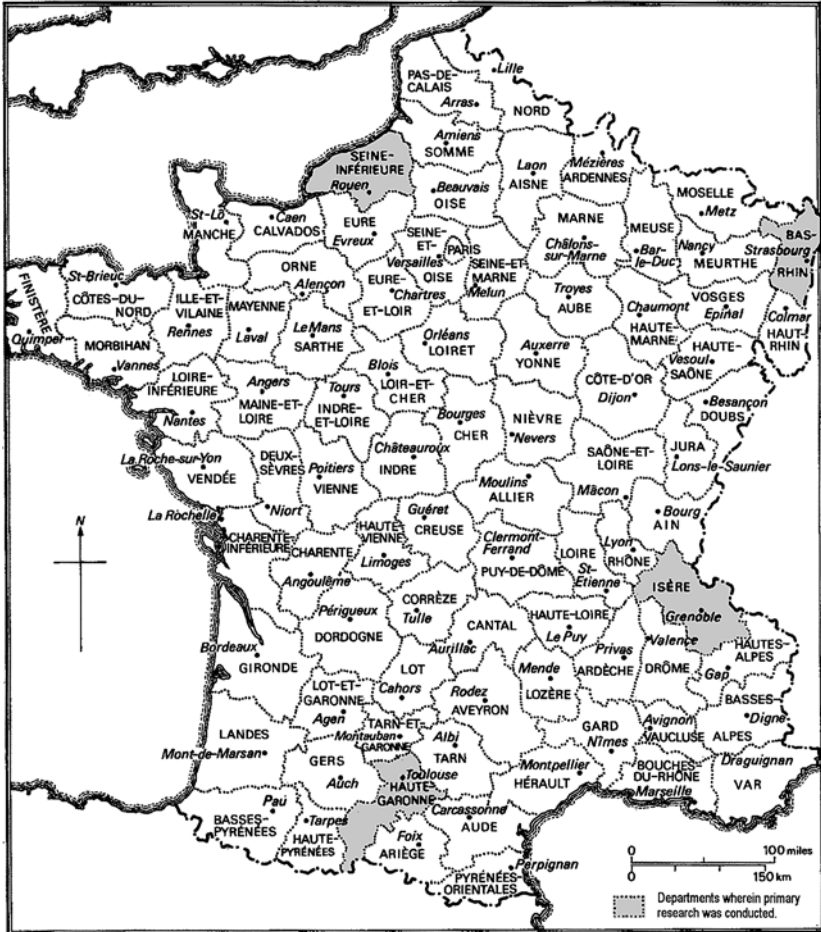
Figure 1 The departments of France and their capitals in 1814