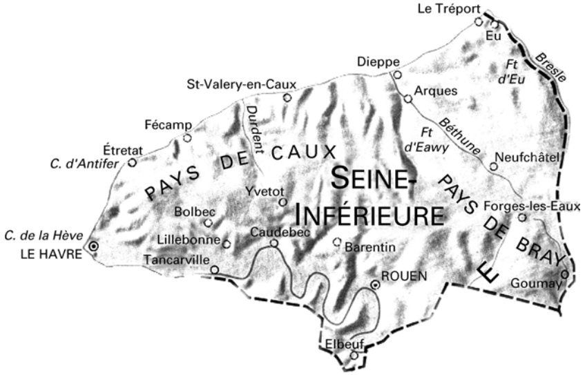
Figure 5 The Seine-Inférieure