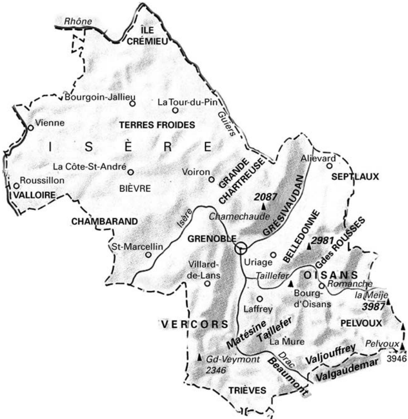
Figure 3 The Isère