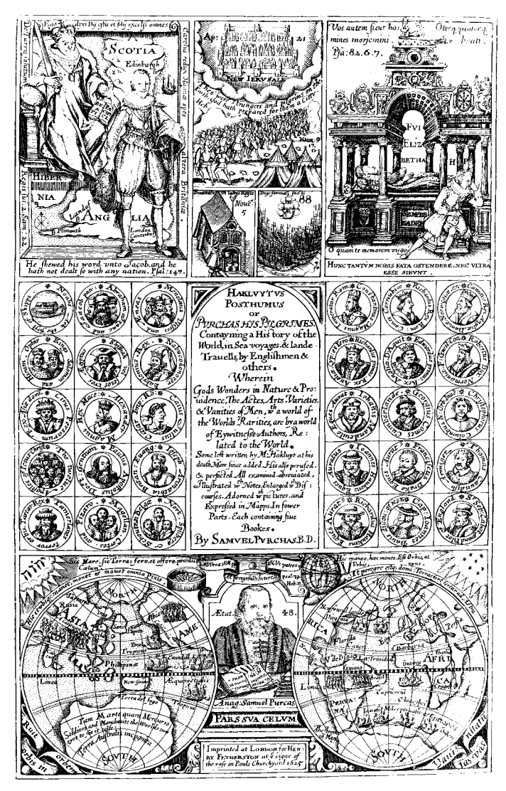
Title page from Samuel Purchas, Purchas His Pilgrimes (1625).

discovered more recently and, within each section, a chronological order from earliest to latest.