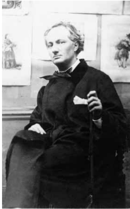
10. Etienne Carjat, Charles Baudelaire "aux gravures," c. 1863.

Although more subtle and painterly, Courbet's portrait reproduces the same trenchant features found in Baudelaire's caricatural self-portraits. Moreover, Courbet's Portrait of Baudelaire operates very much like a caricature by reducing the subject's face to its essential, most salient traits (without eliminating resemblance) and by engaging the viewer to "complete" the image mentally. During the 1840s Courbet looked to popular prints for artistic inspiration and painted Trapadoux examining an album of prints. The Portrait of Baudelaire