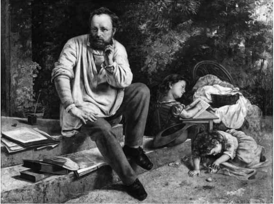
13. Gustave Courbet, Pierre-Joseph Proudhon and His Children , 1865. Paris, Petit Palais, Musée des Beaux-Arts de la Ville de Paris.

Although Courbet's Portrait of Baudelaire has frequently been admired for its suggestiveness and subtle characterization, it has also been unfavorably compared to Fantin-Latour's more straightforward, programmatic portrayal of Baudelaire in Homage to Delacroix (1864; Musée d'Orsay, Paris). 102 Courbet's Portrait of Baudelaire , which is characterized by ambiguity and lack of precision, represents a move away from literal representation toward a more subjective and conceptual interpretation of visual appearances emblematic of the repositioning of the painted portrait in contradistinction to photography. Despite its idiosyncrasies, the pictorial record of this particular encounter between artist and model is indicative of the ontological crisis that portraiture faced at mid-century. At the same time it foreshadows the new directions and expressive potential of the modern portrait – both painted and photographic – which emerged during the second half of the century and are examined in the chapters that follow.