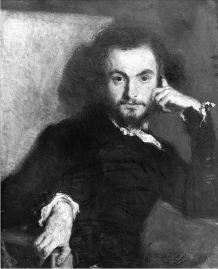
8. Emile Deroy, Charles Baudelaire , 1844. Versailles, Musée du Château de Versailles.

ing, it pushes the conception of portraiture away from objective representation toward subjective evocation and visual ambiguity. 74 Banville, who described the portrait as “tormented and tragic,” noted the clenched, quivering hand and apostrophized the canvas as if it were a living being. 75 Deroy’s seductive Portrait of Baudelaire is suspended between warring principles: intensity and detachment, radiant light and impenetrable darkness, fact and fiction (to borrow Baudelaire’s terms from his “Salon of 1846.”) 76