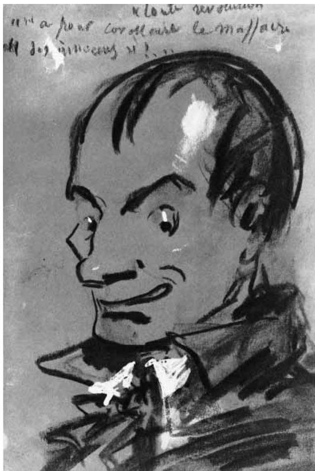
11. Nadar (Gaspard-Félix Tournachon), Charles Baudelaire , preparatory study for the Panthéon Nadar , n.d. Paris, Bibliothèque Nationale de France.

is a peculiar hybrid of the caricatural or conceptual and the painterly – a synthesis also essayed by Daumier during the 1840s, although his paintings remained virtually unknown during his lifetime.