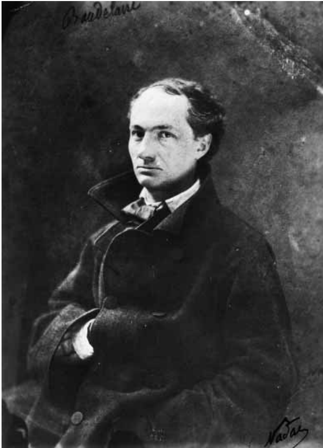
9. Nadar (Gaspard-Félix Tournachon), Charles Baudelaire, c. 1855.

pensity of photographers to record (and exaggerate) all the surface defects of a face, reiterating his criticisms of the photographic medium from his “Salon of 1859.” That year Baudelaire discussed portraiture at some length, insisting that the introduction of the imagination and the poetic in no way precluded resemblance. 93 In his “Salon of 1846” he proclaimed that there were two ways of understanding portraiture: either as history or as fiction. 94 He also insisted that, just as a novel may be more “truthful” than history, so a painterly, imaginative portrait may more clearly explain its model than a meticulous drawing. Courbet’s Portrait of Baudelaire , with its “anticomposition,” blurred, painterly surfaces, and strangely disembodied subject, falls on the side of fiction and embodies what could be characterized as an antiphotographic concept of portraiture. Rather than attempting to represent observed “reality” through additive detail, it operates reductively by simplifying and conceptualizing the sitter. And, consciously or unconsciously, it reiterates in visual terms the dichotomies of mind and body, artist and model.