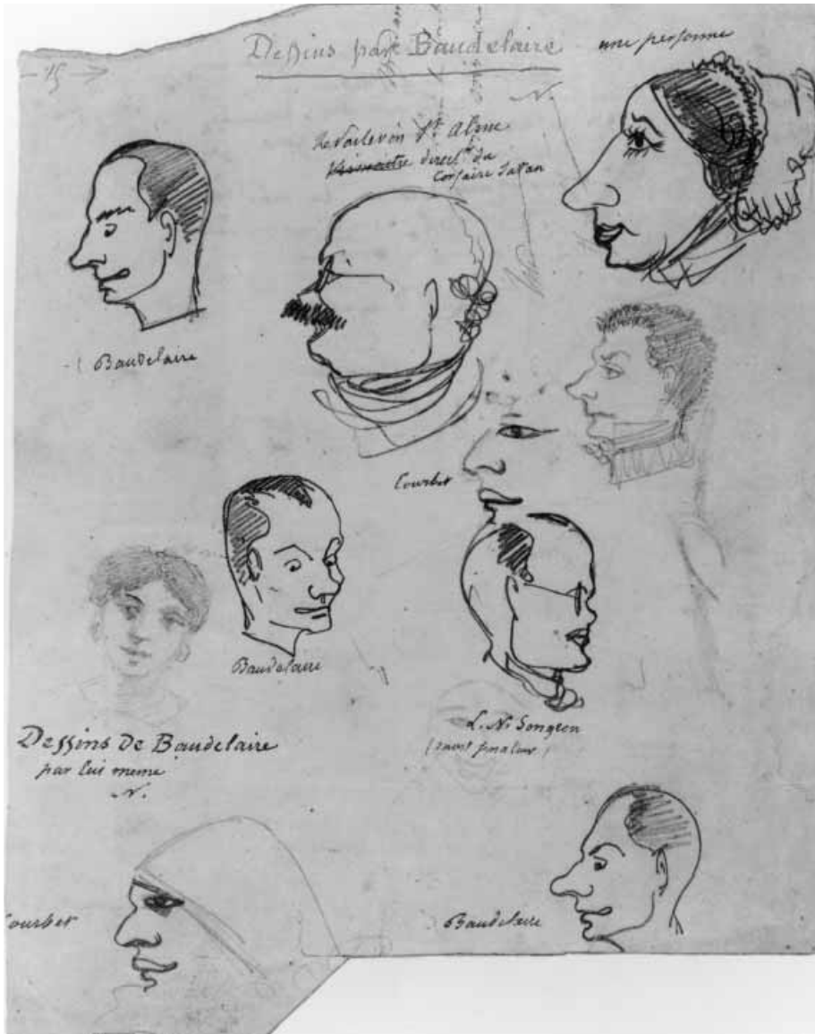
12. Charles Baudelaire, Caricatures of Baudelaire and Friends , annotated by Nadar, c. 1846–48. France, private collection.

bered him, seated meditatively in his garden at 83, rue d'Enfer with his two daughters, and emphasizes the simple joys of family life. The original version, shown at the Salon of 1865, included Proudhon's wife, who was later painted over. This ambitious, genre-like portrait was created both as a public manifesto of Courbet's artistic philosophy and as a personal tribute to his comrade-in-arms. Paradoxically, the resulting canvas is an example of what Albert Boime has dubbed "myopic realism," in which the verisimilitude of the details does not add up to a fully convincing whole. 101