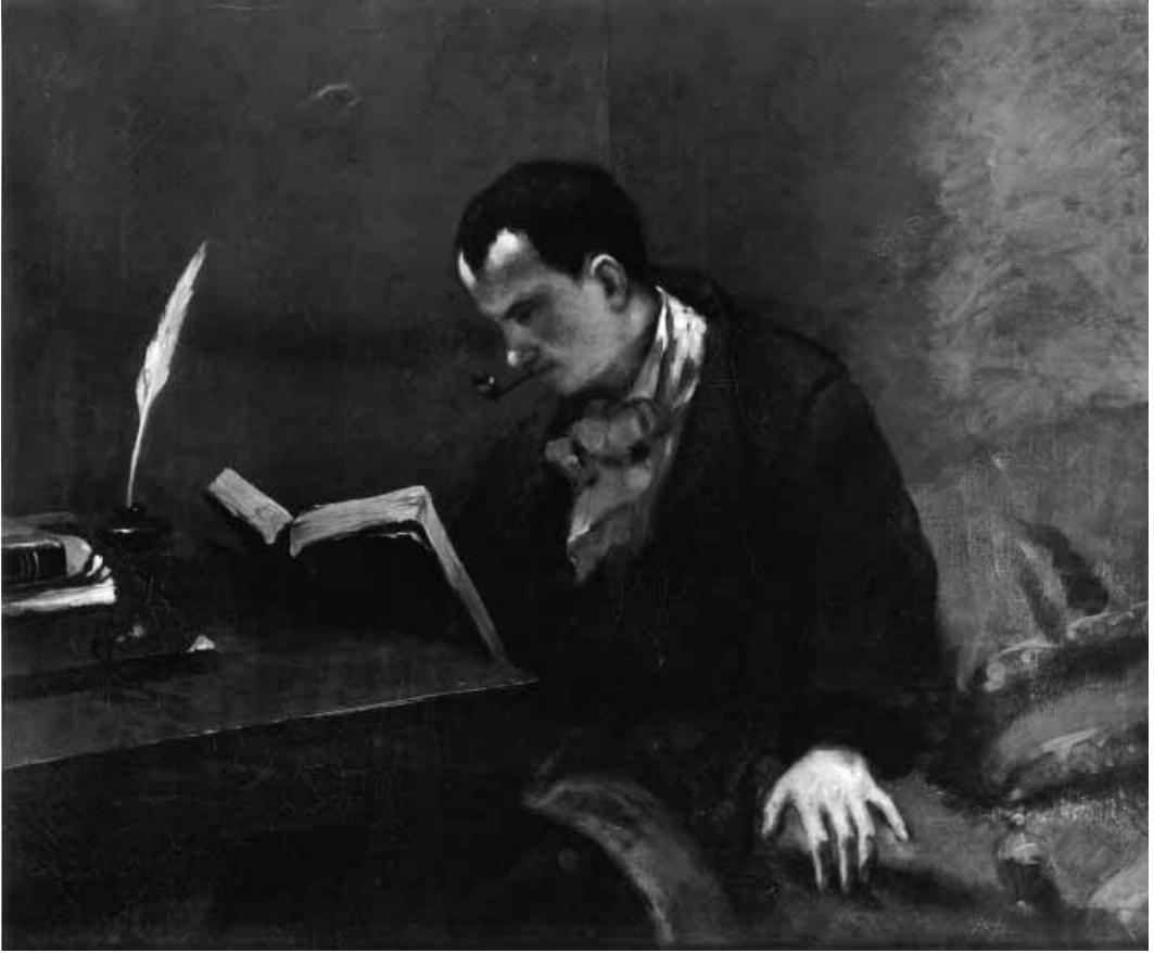
4. Gustave Courbet, Charles Baudelaire, c. 1848–49. Montpellier, Musée Fabre.

well as progressive politics. 19 The bohemia inhabited by Courbet and Baudelaire in the late 1840s was artistic, intellectual, and political. Passageway to success, laboratory for the avant-garde, and repository for radicalism, it provided a fluid space for individual experimentation and the forging of an artistic identity in opposition to bourgeois society. 20 Boisterous bon vivant, braggart, and blagueur , Courbet was a lifelong bohemian, who unabashedly manifested his sociopolitical convictions and his disdain for bourgeois conventions despite his artistic success. Conversely, Baudelaire was a bohemian by necessity rather than inclination. Constantly on the move to escape his creditors and forced to live as a vagabond, Baudelaire nevertheless espoused dandyism as the last flicker of heroism in a decadent age. 21 Indeed, what Baudelaire sought (and found) in bohemia was the cult of multiple sensations and escape through intoxication, which provided the catalyst for his creativity. Moreover, bohemia represented the opposite pole of dandyism, a necessary counterpoise in the dualistic system he envisaged, in which the self was both vaporized and central-