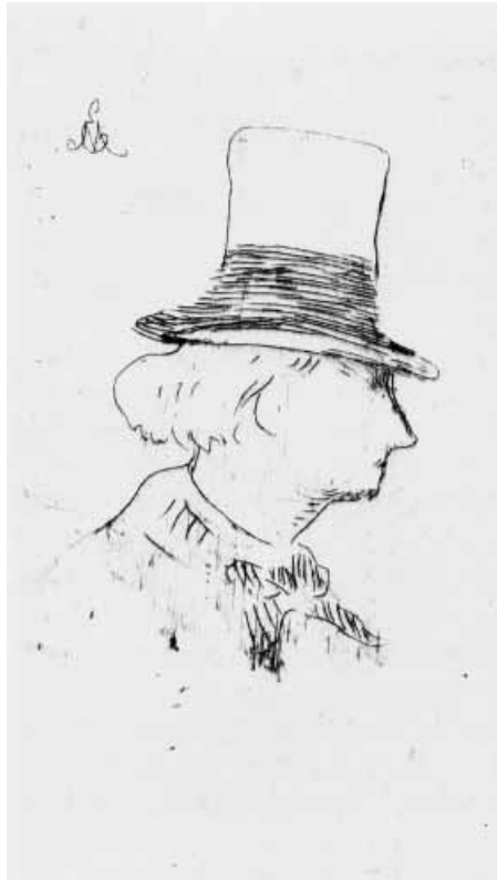
14. Edouard Manet, Charles Baudelaire in Profile , n.d. New York, The Metropolitan Museum of Art, Rogers Fund, 1921.

The proliferation of photography, which precipitated an identity crisis for the painted portrait at mid-century, also, paradoxically, freed portrait painters to