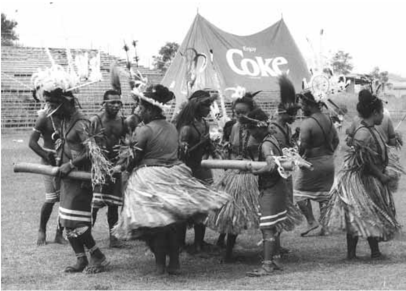
Plate 1.3 A sign of the globalised times: dancers from Central Province, Papua New Guinea performing at a 1997 cultural show.

contradiction in terms. The only way in which anthropological knowledge can be applied in development contexts is to couple it with a knowledge of some other field such as agriculture, engineering, medicine or economics. Training in one of these vocational areas combined with an anthropological background that fosters awareness of and sympathy for other cultural arrangements is far more likely to promote a sustainable and workable development project than technical expertise alone. Otherwise, anthropologists can only advise on social problems and policies as they think those concerned perceive them, and here they run the risk of indulging in social engineering – interfering in uncalled-for ways in other people's sociocultural arrangements.