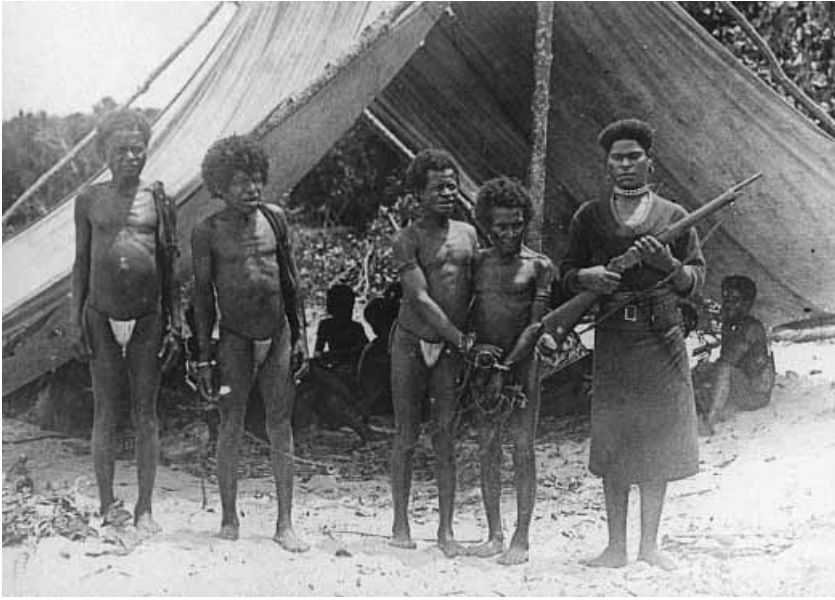
Plate 1.2 An armed Papuan constable taking manacled prisoners back to stand trial.

Internal forces are rarely solely responsible for change, however, because, leaving aside the problem of distinguishing one society from another, few societies exist in isolation. Besides generating change themselves, societies inevitably adopt practices and objects from their neighbours. Many changes in societies occur as a result of pressures from outside. The critical questions are again the extent and speed of these changes and who is controlling them. In traditional Melanesian cultures it was the people concerned who made these decisions, and the rate at which they adopted traits from their neighbours was gradual and the resulting changes rarely disruptive. It is when one society moves on another and forces it to change that the situation is altered dramatically – the extent and speed of change increase markedly, resulting in social disruption and confusion. This happens only when the invading society is sufficiently powerful to dominate the other which invariably means that it is technologically superior. We recognise here the historically inevitable intrusion of industrial society into the non-industrial cultures of the Pacific, which started with European exploration of the world and has proceeded apace over the past 200 years, leaving very few if any places unaffected. This is the change that is associated with economic development in the Third World.