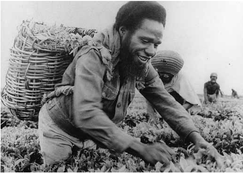
Plate 1.4 Picking tea on a plantation in the Western Highlands Province, Papua New Guinea.

enormous social problems posed by economic development when instead they are amenable only to compromise and attempts at conciliation. The idea that social scientists, and anthropologists in particular, can help move less developed countries relatively painlessly into the industrial world is a dangerous myth, raising people's expectations far beyond what is practicable and leading to disillusionment and even a sense of betrayal.