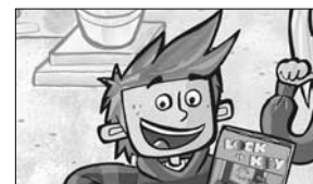
I am Grandma Star's