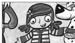
I am Grandpa Star's