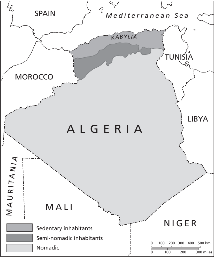
Settlement patterns in late nineteenth-century Algeria