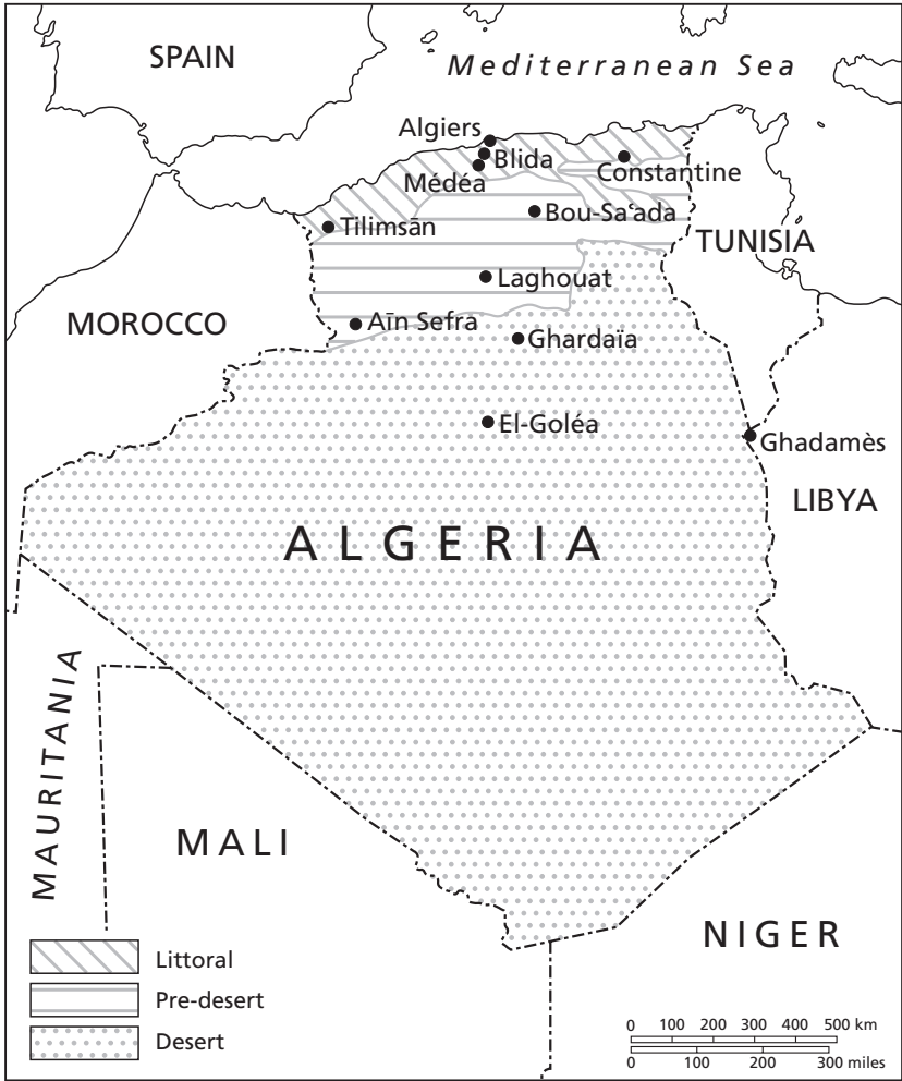
Ecological regions of Algeria