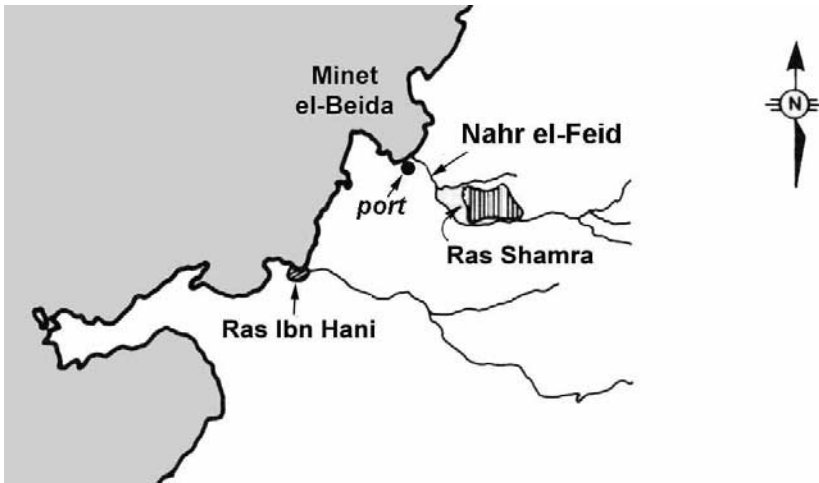
Figure 1.3 Region of Ras Shamra

in biblical literature (Isa 14:13; cp. Ps 48:2), rises majestically on the horizon as one looks to the north from Ugarit. This was the dwelling place of the entire Ugaritic pantheon ( KTU 1.47 [ KTU is an abbreviation for the second edition of The Cuneiform Alphabetic Texts from Ugarit, Ras Ibn Hani and Other Places , which is translated from the German original edition]) and, most prominently, the storm god Baal. Out of this mountain, according to the local religious beliefs, the cosmic waters of creation flowed (cp. Gen 1:2; 2:10–14).