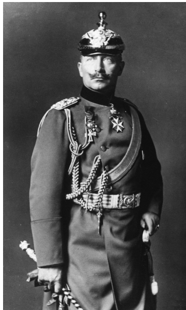
Kaiser Wilhelm, the last Emperor of Germany, who led his country to defeat in the First World War.