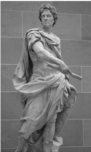
Julius Caesar, the Roman general and statesman.

Julius Caesar and his adopted son Augustus gave their names to the months of July and August.