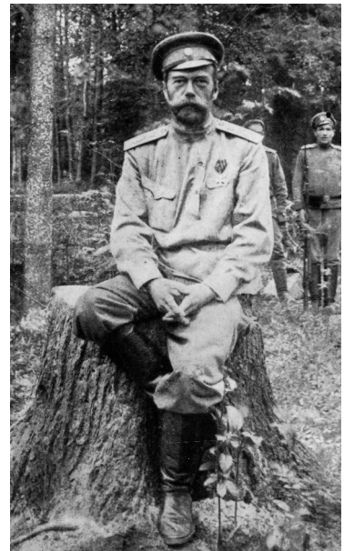
Czar Nicholas, the last Czar of Russia, who was executed in 1918.